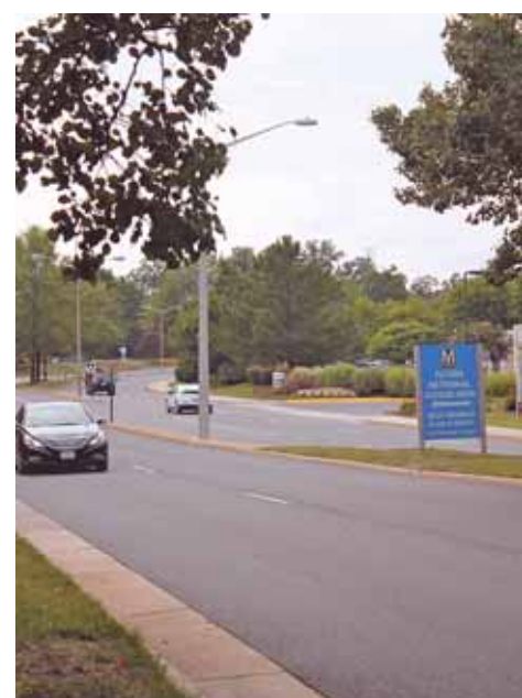
Herndon Town Council approved to consider amendments to the zoning near the future Metro station.