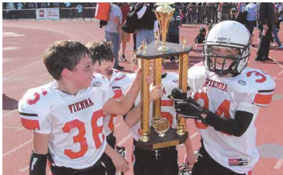
Vienna Youth Football players carry team trophy at last year's FCYFL awards recognition.