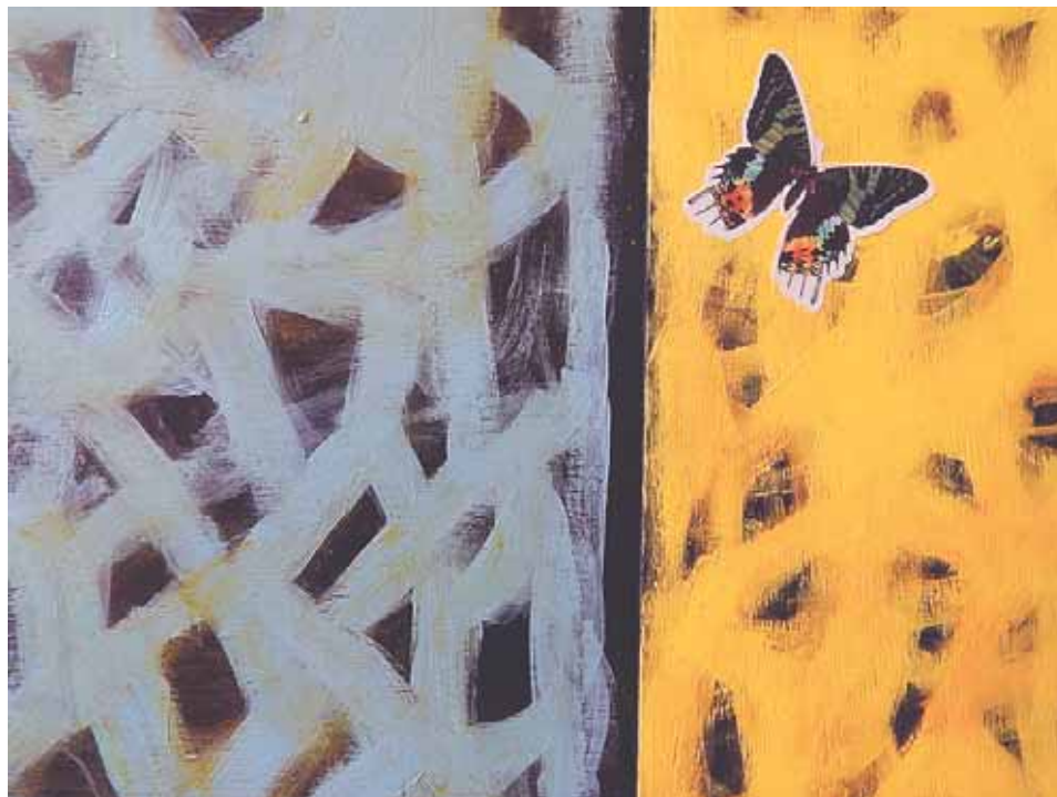
View fine art by the 11 artists of Reston Art Gallery & Studios (RAGS) at ArtSpace Herndon from July 29 - Aug. 24.

23rd Annual Reston Century Bike Tour. 6:30 a.m.- 5p.m. Reston Town Center Plaza, 11900 Market St., Reston. Ride 30, 63, or 100 mile bike routes and a post-ride party.