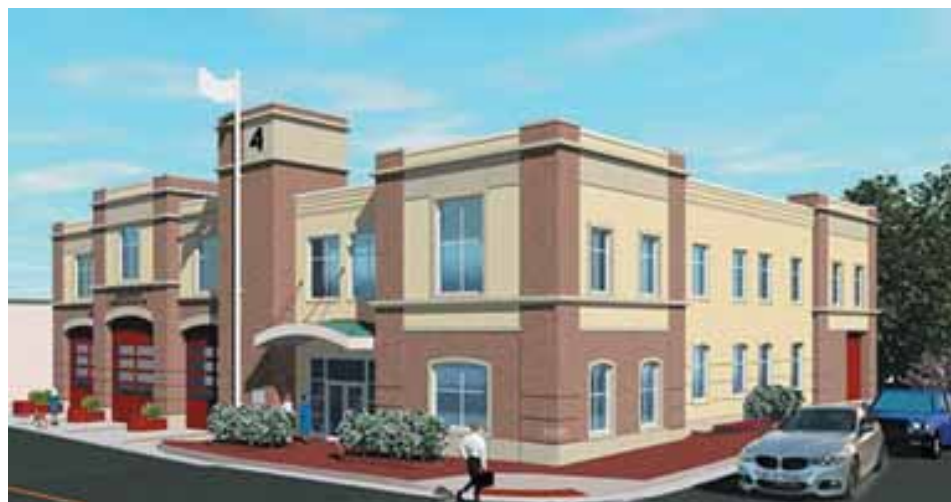
Image of proposed new fire station which will be constructed on Spring Street.

bond referendum Fairfax County voters approved last November. The current two-story, 8,162 square foot fire station on Spring Street is the oldest fire station still in operation in Fairfax County. Currently the station employs six firefighters. Additional space at a new structure will allow the station to add specialty units as needed, such as a rescue unit or a second transport unit. As currently planned, it will have a maximum height of 38 feet for the elevator tower and 32 feet for the rest of the building.