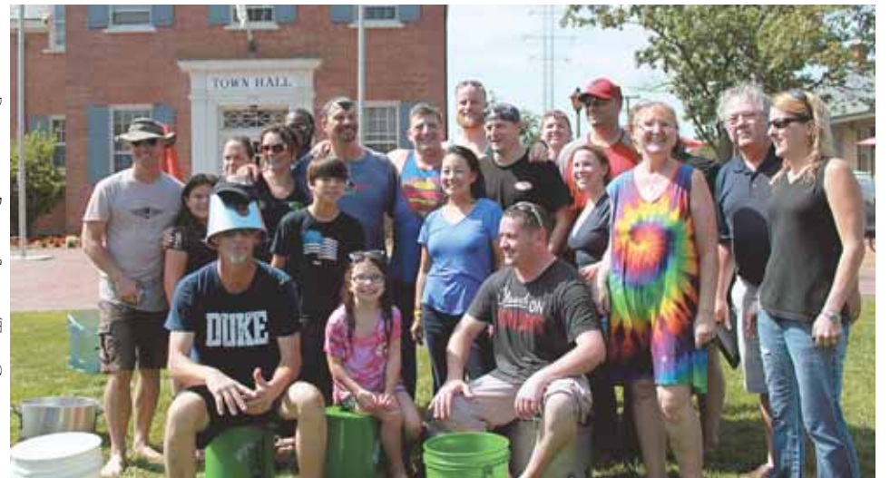
Most of the participants for the ALS Ice Bucket Challenge on Saturday.