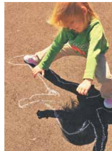
Feature photo: Summer Fun.