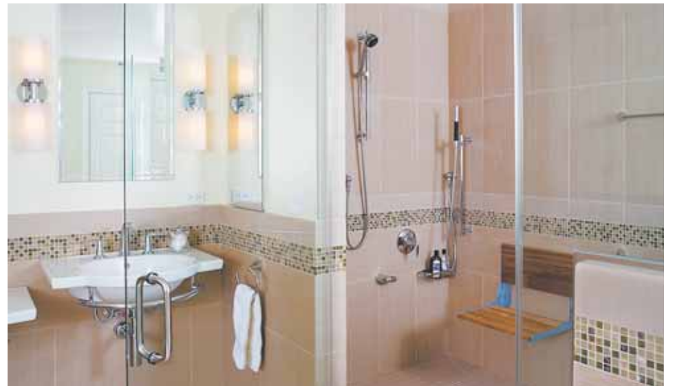
When remodeling this bathroom, Glickman Design Build added a bench to this shower. Such features can help seniors to downsize and live alone safely.

“There is also growing evidence of the benefits of cognitive training for everyday functioning – perhaps the strongest evidence is perception training – visual and auditory perception. Several studies, including our own, have shown broad transfer of benefits from perception training to everyday functioning.”