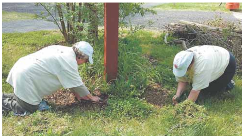
Alexandria at Home volunteers helps a member with yard work. Such services allow seniors to downsize and live alone more easily.