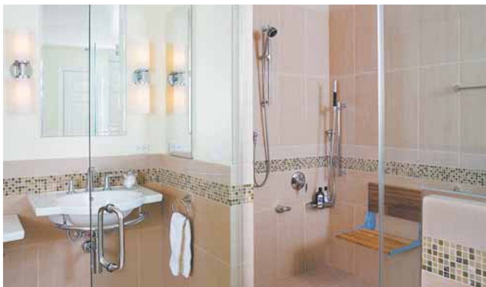
When remodeling this bathroom, Glickman Design Build added a bench to this shower. Such features can help seniors to downsize and live alone safely.

“There is also growing evidence of the benefits of cognitive training for everyday functioning – perhaps the strongest evidence is perception training – visual and auditory perception. Several studies, including our own, have shown broad transfer of benefits from perception training to everyday functioning.”