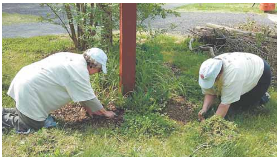
Alexandria at Home volunteers help a member with yard work. Such services allow seniors to downsize and live alone more easily.