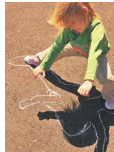
Feature photo: Summer Fun.