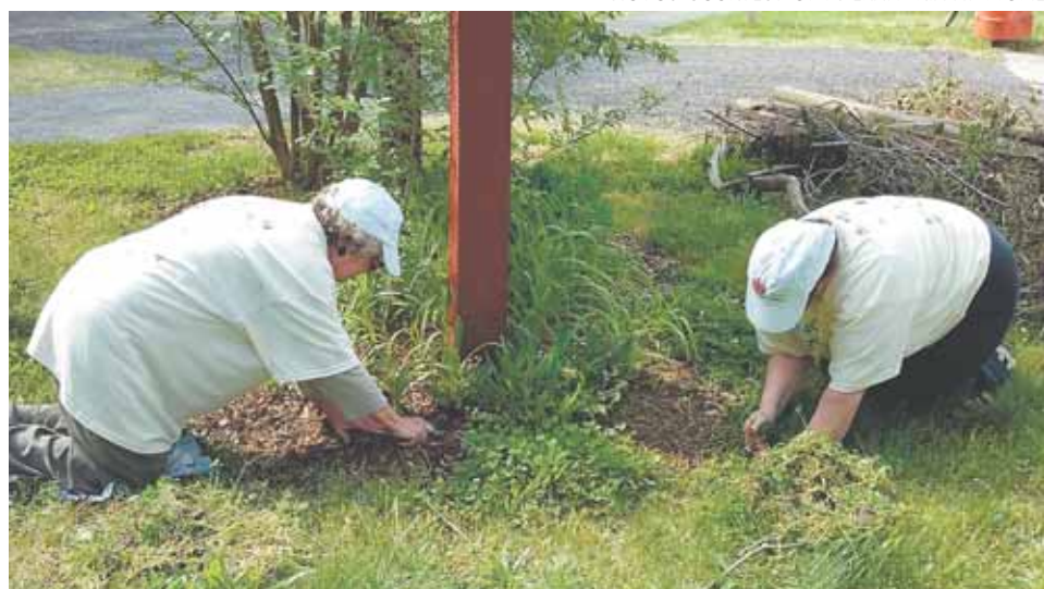
Alexandria at Home volunteers help a member with yard work. Such services allow seniors to downsize and live alone more easily.