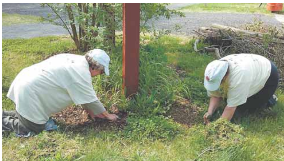
Alexandria at Home volunteers helps a member with yard work. Such services allow seniors to downsize and live alone more easily.