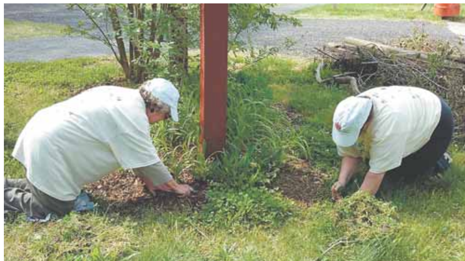
Alexandria at Home volunteers help a member with yard work. Such services allow seniors to downsize and live alone more easily.