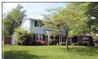
Fairfax/Kings Park West $484,500 Lovely 4 bedroom home with garage * Wood floors * Updated kitchen that opens to private patio * Living room with fireplace * Family room opens to deck & hot tub * Large fenced back yard * Fresh paint & carpet. Call Judy for more information.