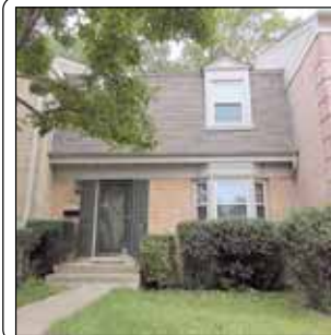
Fairfax $415,000 Lovely 3 br, 2.2 bath well kept townhouse, many upgrades, large rooms, porch & patio, large rec room with fireplace, in culdesac backing to woods, close to VRE, shopping, Robinson schools, great location.