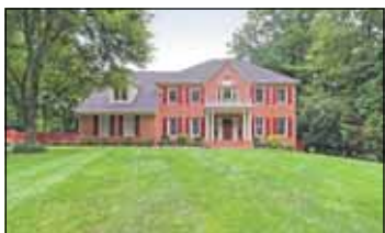
Fairfax $899,000 Wonderful brick front colonial sited on perfect 2/3 acre w/ a pool

CAROL Hermandofer Associates Top 1% of Agents Nationally