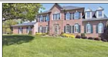
CROSSPOINTE $769,900 Over 5,000 SF Manchester model with wing extension! Plantation shutters, custom built-ins, 2 home offices, huge master BR suite w/ elegant new bathroom! Finished walkout basement! Oversized garage for 2 large vehicles! Visit 8709CrossChaseCircle.com