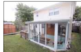
Alexandria $375,000 Move in ready, just bring your boxes. Gorgeous Large Sunroom, Upgraded Eat in Kitchen, New Hdw Floors, New Carpet, Fresh Paint, Fenced Rear Yard, Easy access to all major commuting routes and 2 Metro Stations.