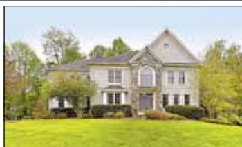
Clifton $1,249,000 Stunning Custom Home on Perfect 2+ Acres!