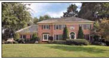
CROSSPOINTE $829,900 Former William Berry model home features a grand 2 story family room with palladian windows! Huge updated kitchen w/ high-end SS appliances & granite counters. Large BR's w/ ensuite bathrooms. Finished walkout basement to stone patio. Custom-built library!