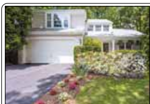
Fairfax $524,000 Seller to pay Closing Cost for purchaser of this stunning contemporary sited on a cul-de-sac, just a 5 minute walk to the pool, park, tennis courts & Woodglen Lake! Inside delights include 3 large & sunny bedrooms (room for 4), 3.5 baths, a kitchen with Corian counters and seamless sink; a gorgeous glass walled family room; a finished Rec Room & a private master suite with picture windows and huge master bath.

Access the Realtors Multiple Listing Service: Go to www.searchvirginia.listingbook.com