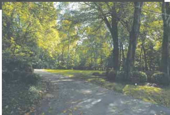
6 1862 Brothers Road, Vienna — $1,500,000