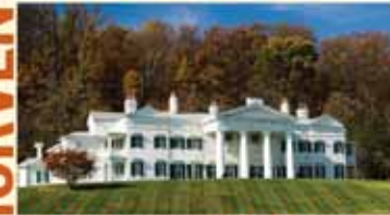
Park Governor's Mansion