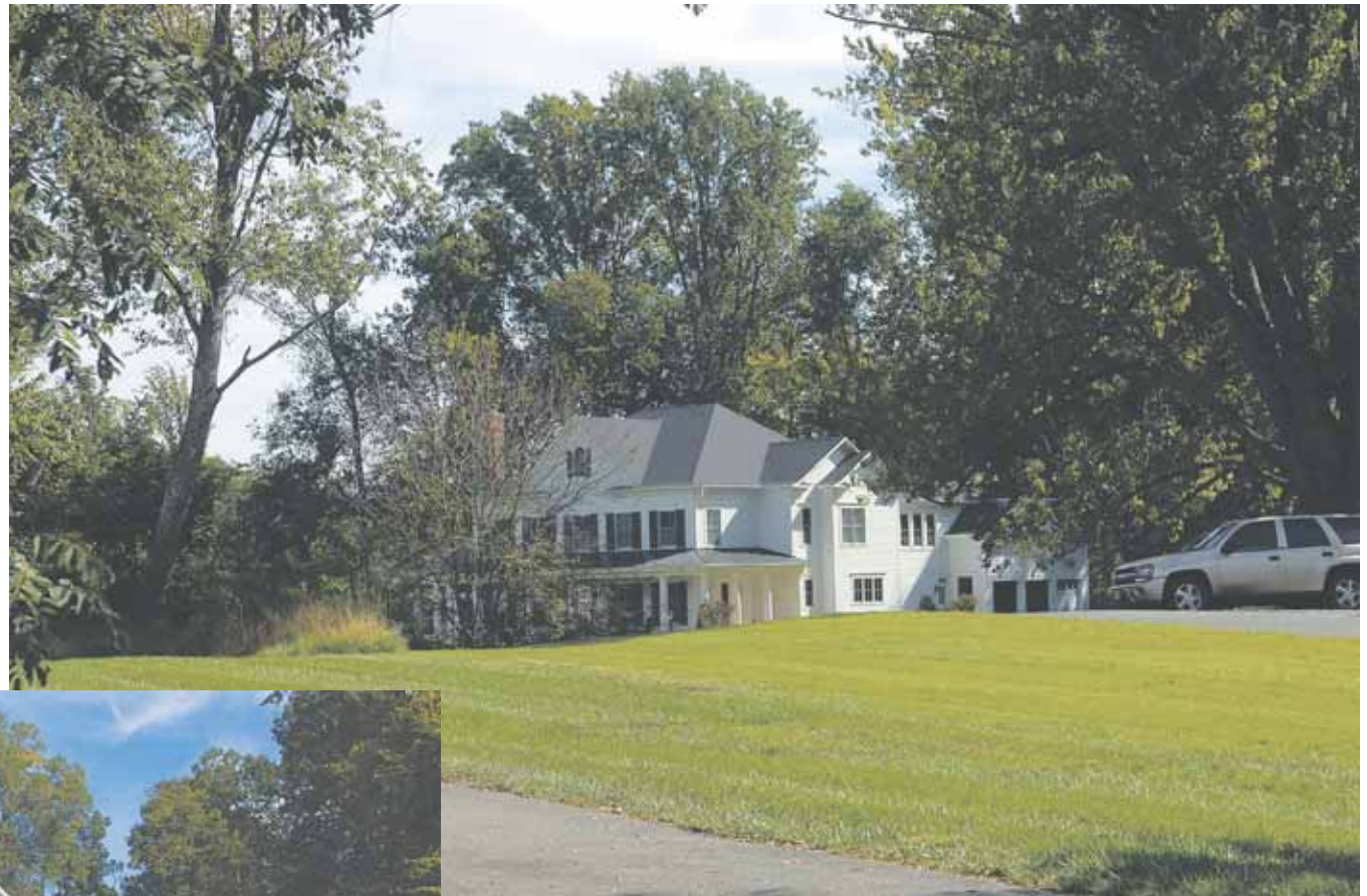
1 11797 Stuart Mill Road, Oakton — $2,198,430

IN AUGUST 2014, 116 HOMES SOLD BETWEEN $2,198,430- $219,000 IN THE VIENNA AND OAKTON AREA.