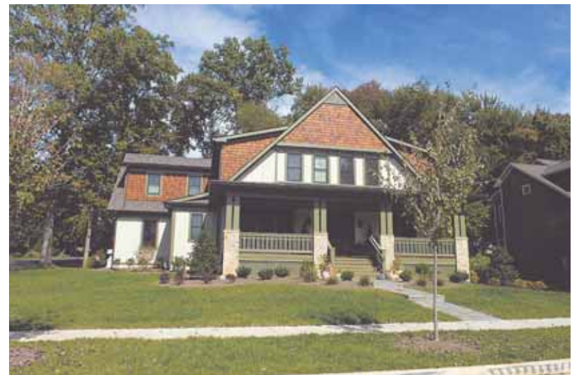
4 900 Glyndon Street SE, Vienna — $1,574,482