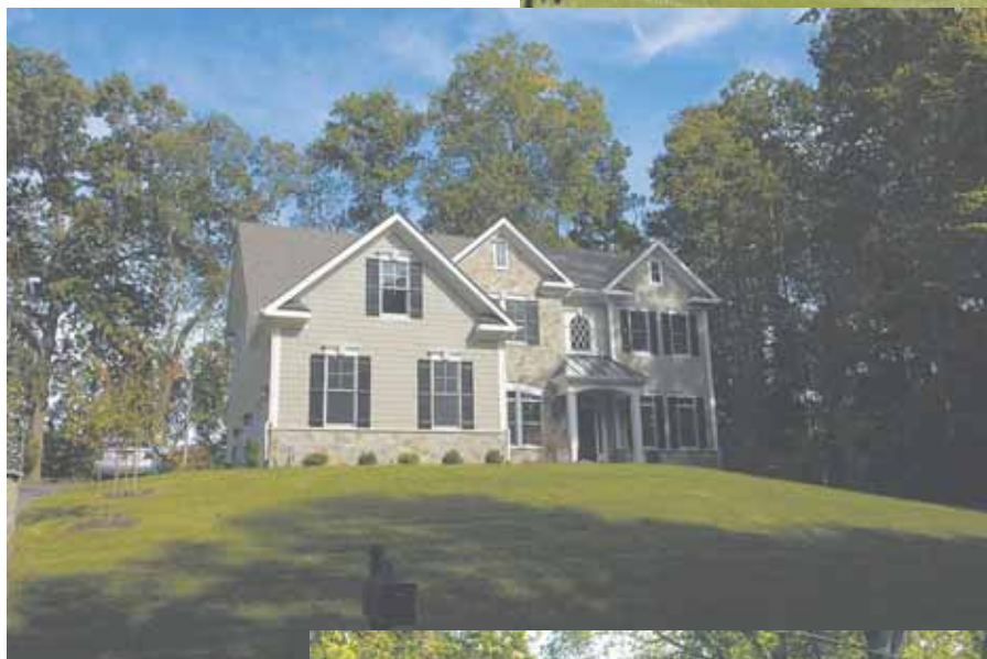
2 3003 Weber Place, Oakton — $1,729,795