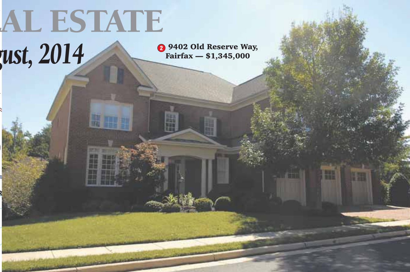
2 9402 Old Reserve Way, Fairfax — $1,345,000