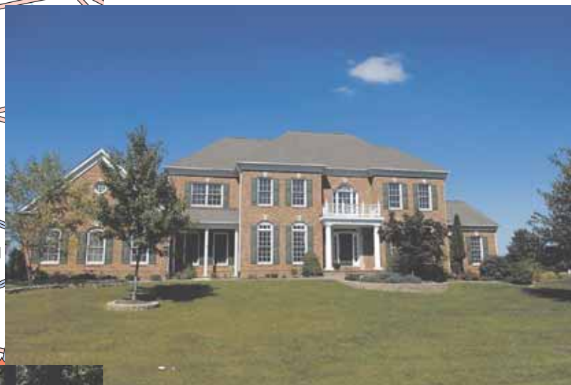
3 5152 Pleasant Forest Drive, Centreville — $1,165,000