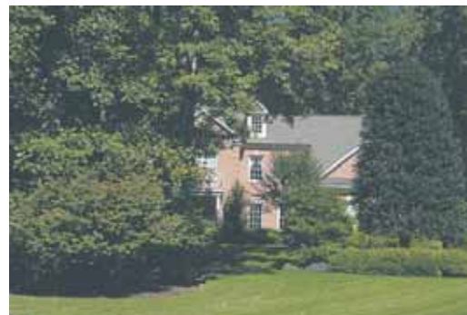
7 9812 Portside Drive, Burke — $1,035,000