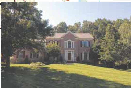
6 10107 Waterside Drive, Burke — $1,050,000