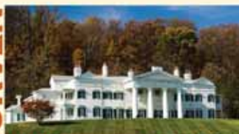
Park Governor's Mansion