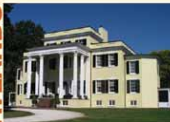
Historic House & Gardens