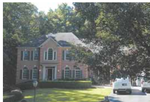
8 13749 Balmoral Greens Avenue, Clifton — $1,030,000