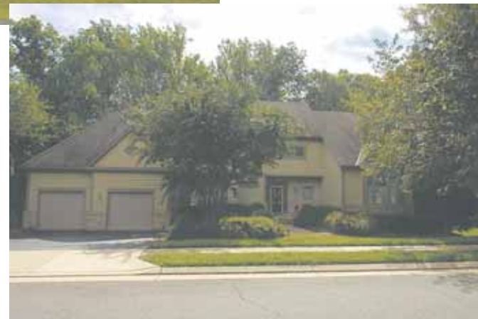
6 11303 Bright Pond Lane, Reston — $975,000