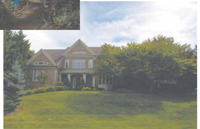
2 11307 Stones Throw Drive, Reston — $1,110,000