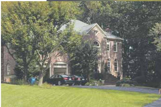
4 1250 New Bedford Lane, Reston — $1,069,000