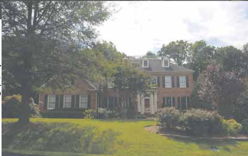
3 11593 Cedar Chase Road, Herndon — $1,080,000