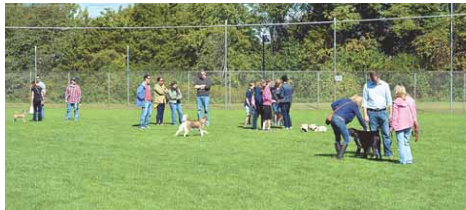
In addition to a variety of vendors, the Oct. 5 HerndDOG Bark Bash at Bready Park included an off leash area. The event was free and open to the public.

Some businesses and organizations committed to the event this year included the Animals' House, All Friends Pet Care, Dogtopia of Herndon, Canine Carousel, Herndon Animal Medical Center and Whole Pet Central. Also attend-