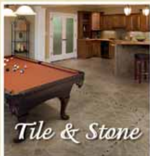
Tile & Stone