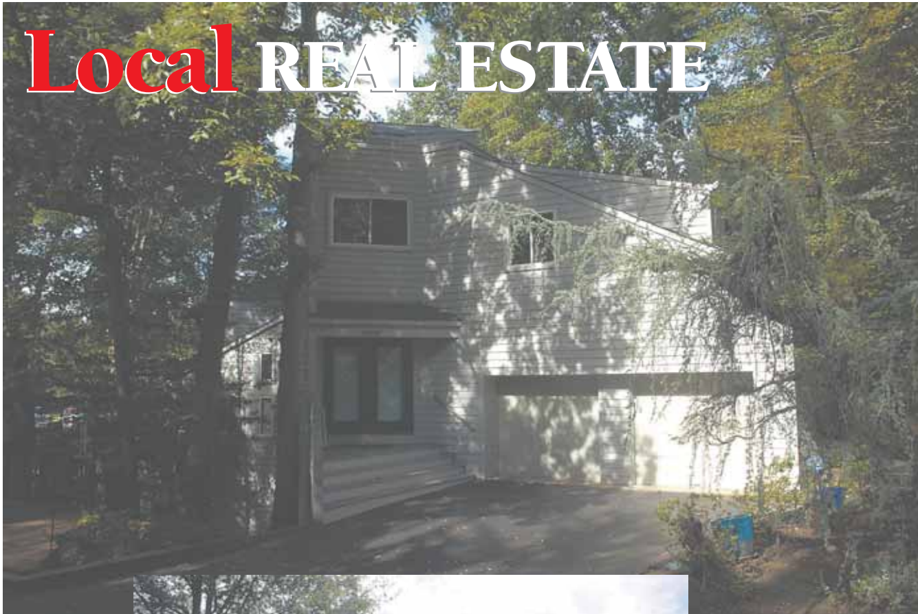
1 2258 Compass Point Lane, Reston — $1,325,000