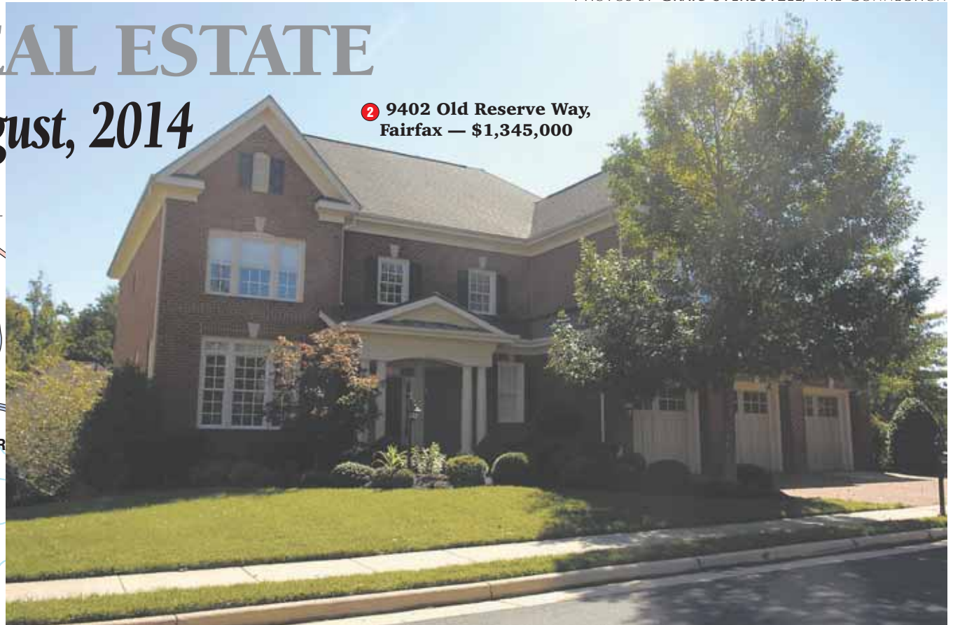
2 9402 Old Reserve Way, Fairfax — $1,345,000