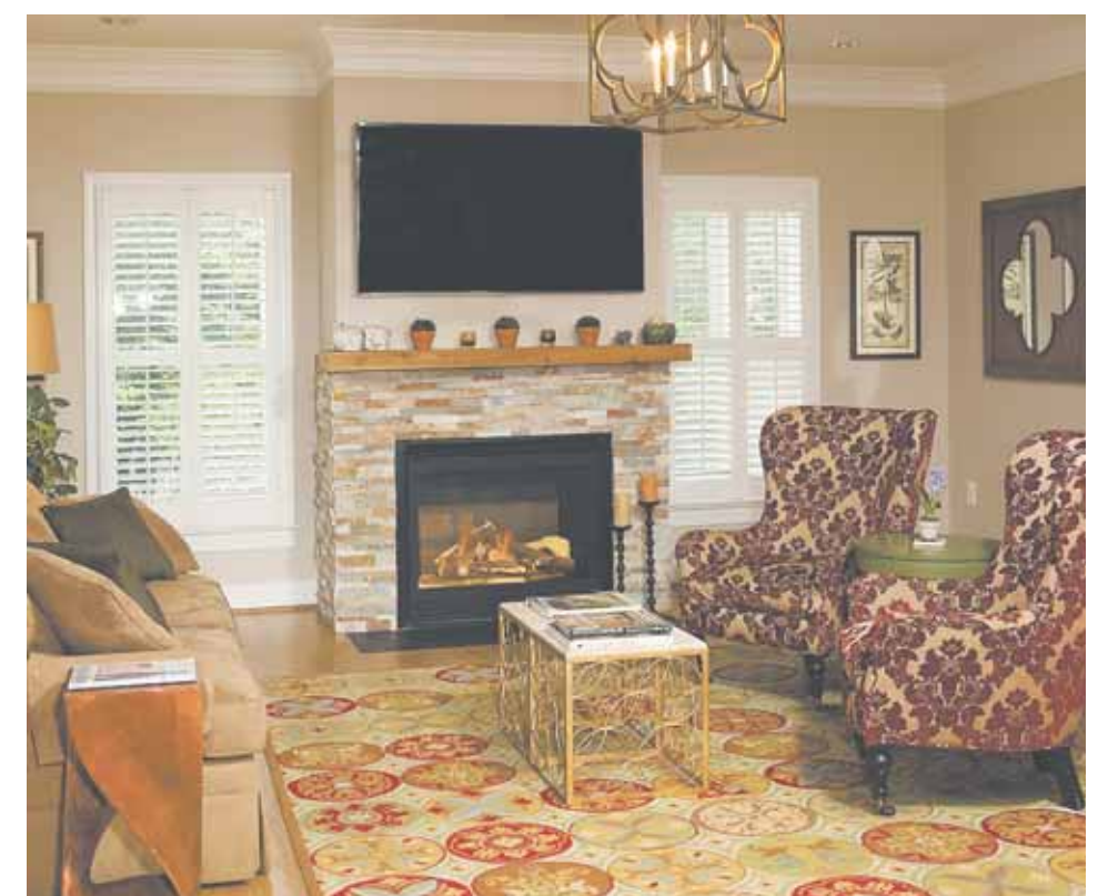
The fireplace hearth in the Layfield den was completely remade in the plan executed by Sun Design Remodeling.

The Layfield kitchen remodeled by Sun Design Remodeling includes granite surfaces, marble tile wall coverings and a coffered ceiling.