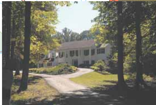
5 6297 Clifton Road, Clifton — $1,190,000