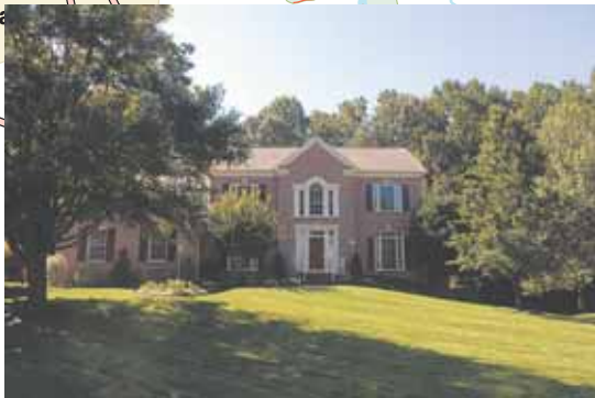
6 10107 Waterside Drive, Burke — $1,050,000