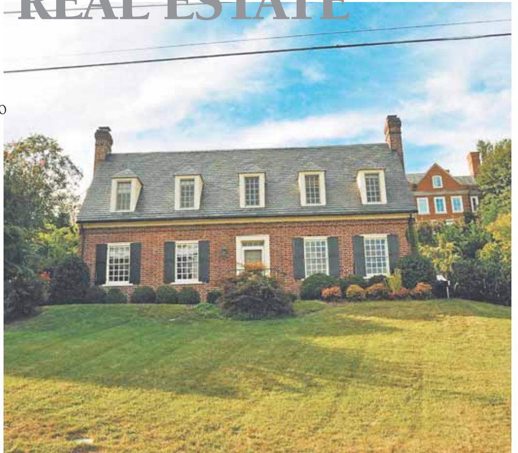
1 1806 Edgehill Drive — $1,599,000