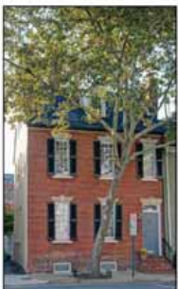
Old Town $1,295,000