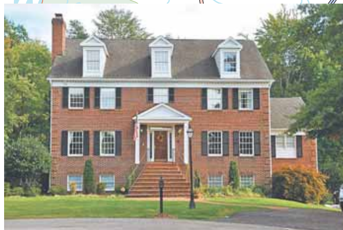
8 4201 Kimbreelee Court — $900,000