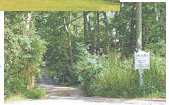
7 1110 Arcturus Lane — $950,000