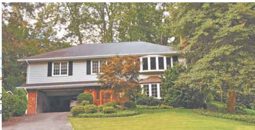
6 1210 Huntly Place — $950,000