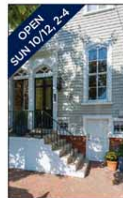
Old Town $1,025,000

George Myers 703.585.8301 www.McEneaney.com