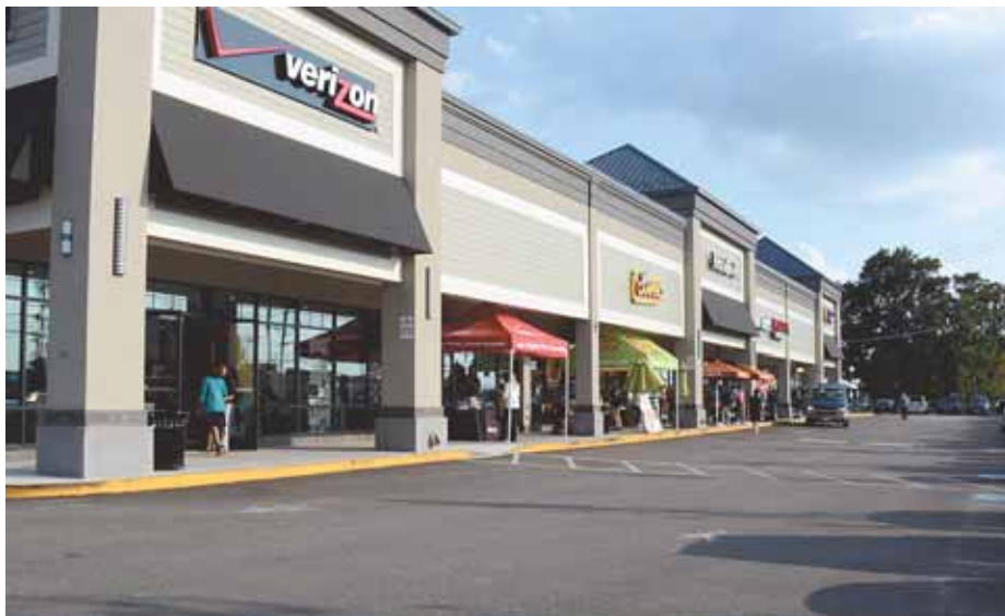
Fordson Place Shopping Center shops offered discounts and giveaways at its grand opening.