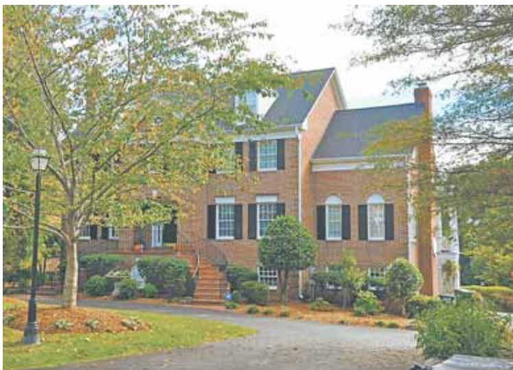
4 4205 Kimbreelee Court — $1,070,000