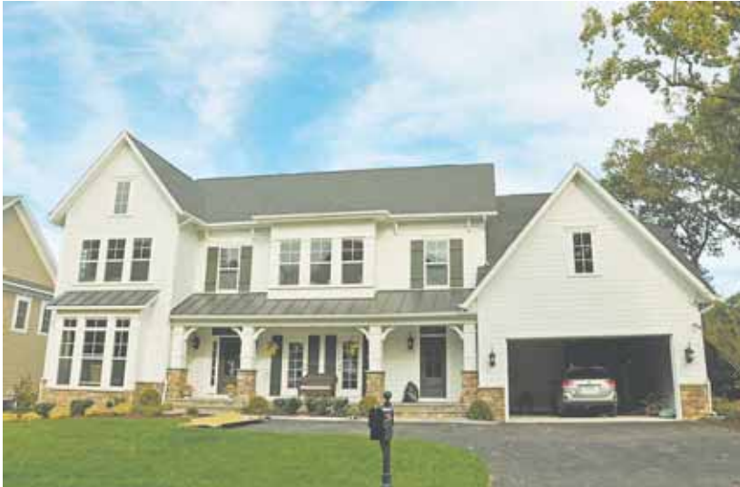
2 7103 Marlan Drive — $1,420,000

IN AUGUST 2014, 132 HOMES SOLD BETWEEN $1,599,000-$116,500 IN THE MOUNT VERNON AREA.