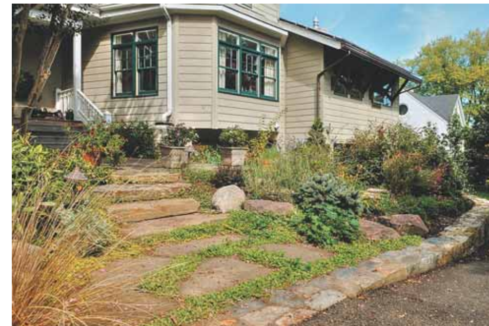
120 West Maple Street

The Commission sponsors the Alexandria Beautification Awards each year, recognizing community member's efforts to contribute to the beautification of their neighborhoods and public vistas with landscaping and overall aesthetic design. Nominations