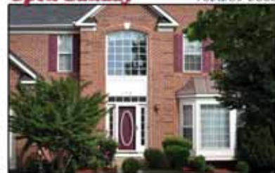
Lorton • Open Floor Plan • New Granite • $575,000