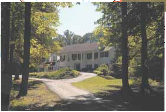
5 6297 Clifton Road, Clifton — $1,190,000