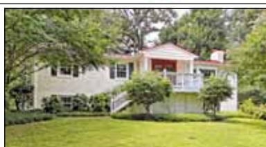
Clifton - $699,00 Light, bright raised rambler on pristine 5.5 acres

View more photos at www.hermendorfer.com