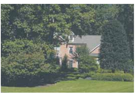
7 9812 Portside Drive, Burke — $1,035,000