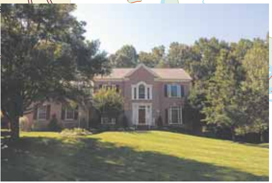
6 10107 Waterside Drive, Burke — $1,050,000