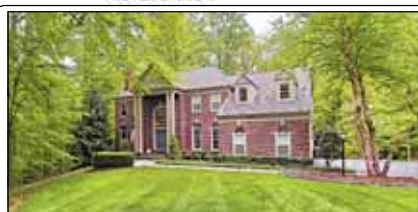
Clifton - $950,000 Gorgeous colonial on beautiful 5+ acres