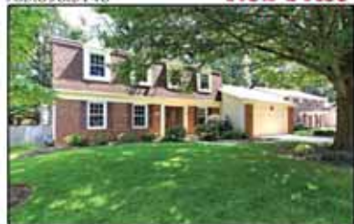
Fairfax • George Mason Forest • Updated w/Pool • $715,000