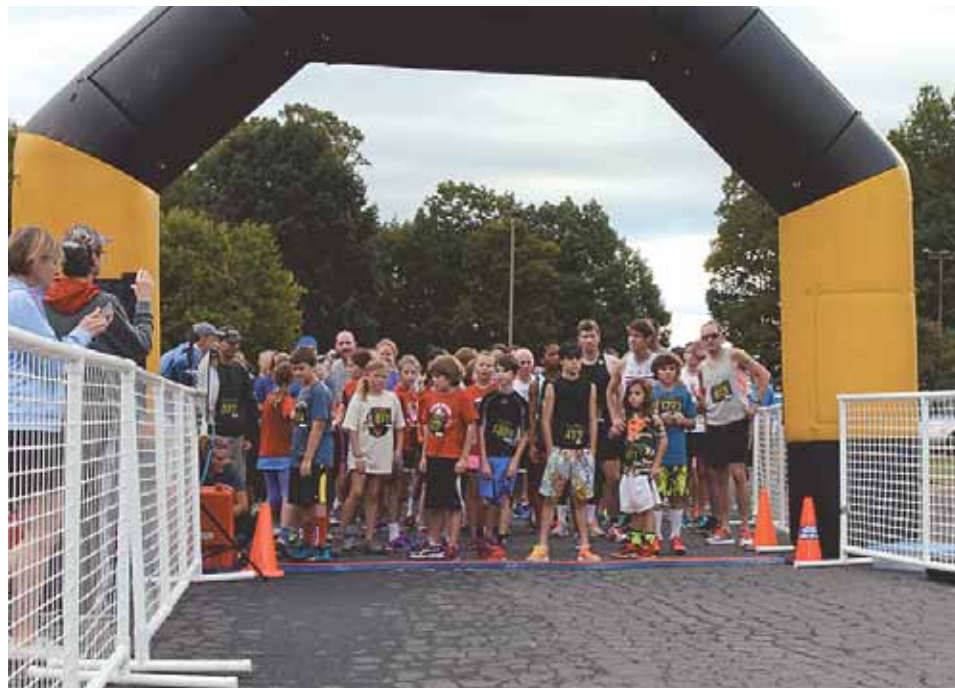
Young, eager runners pushed to the front of the first annual Art of Driving Survive the 5 5K on Oct. 4.

That's where the "Survive the 5" in the race's title comes in. It's a reference to the