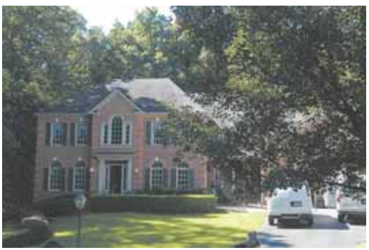
8 13749 Balmoral Greens Avenue, Clifton — $1,030,000