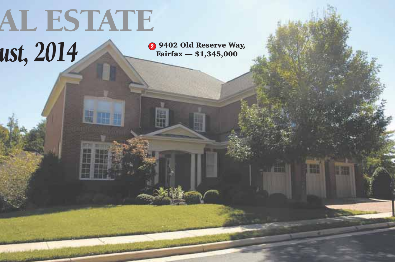
2 9402 Old Reserve Way, Fairfax — $1,345,000