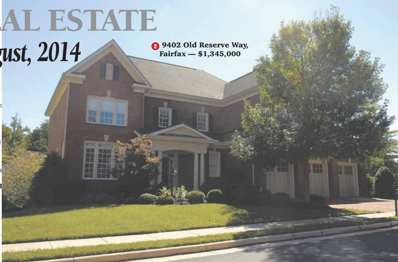
2 9402 Old Reserve Way, Fairfax — $1,345,000