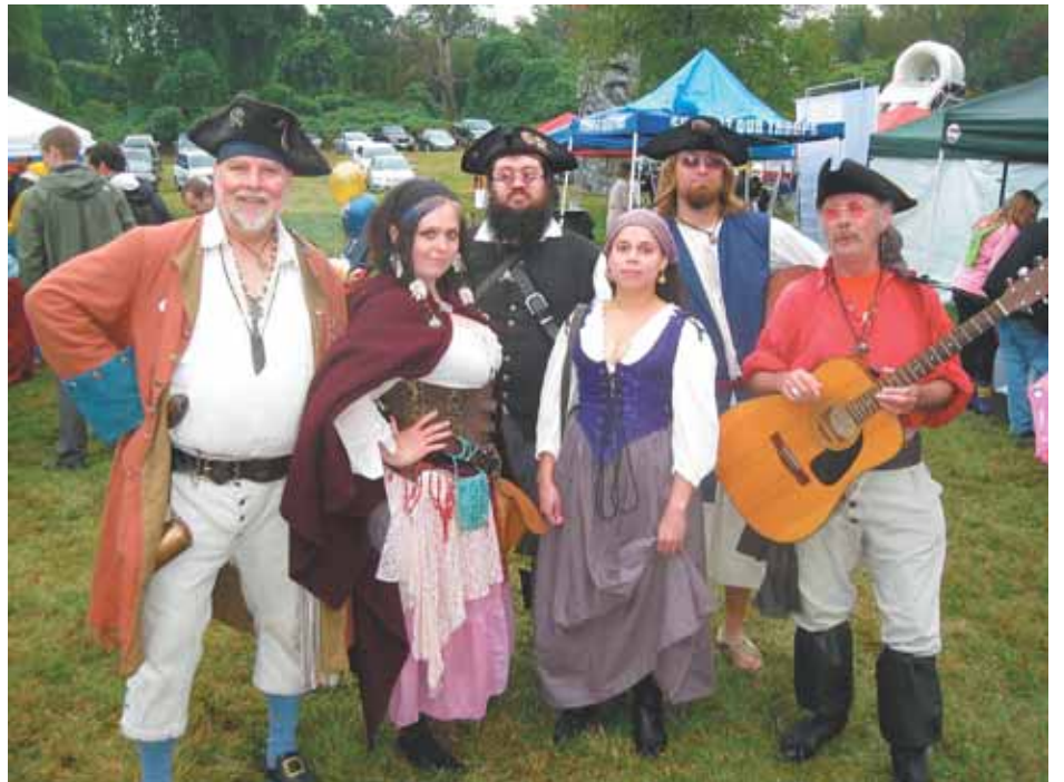
The folk music band, Pirates for Sail.