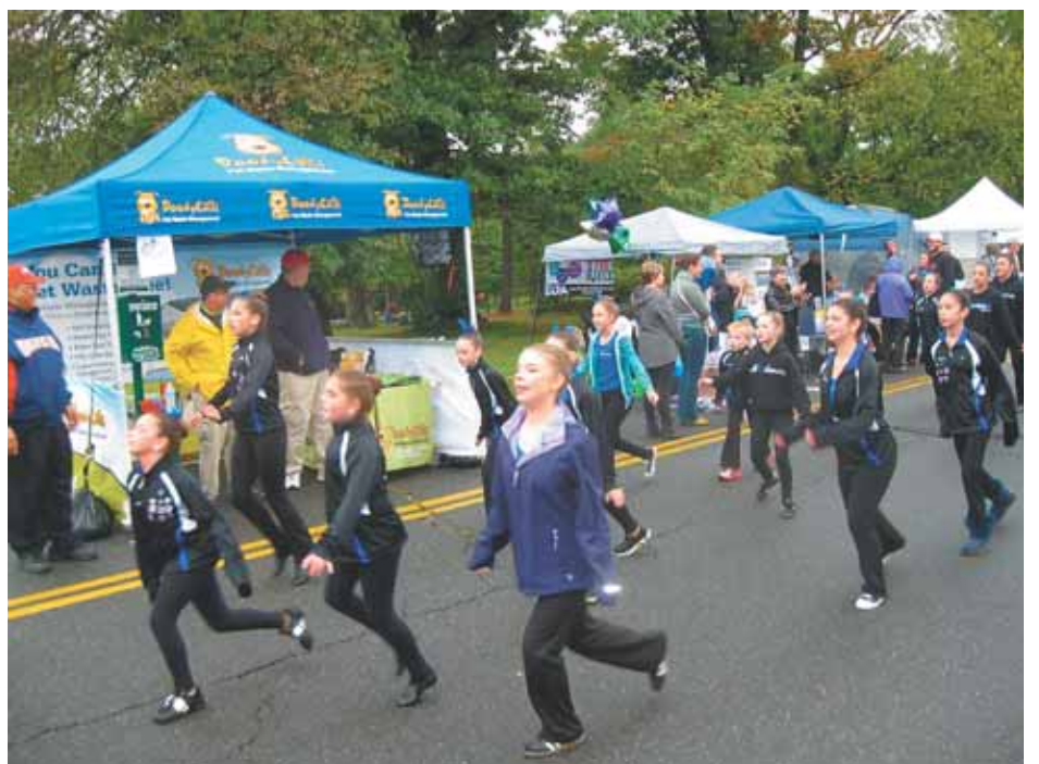
Members of the Centreville Dance Theatre perform during the Centreville Day Parade.