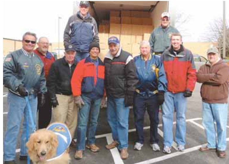
Members of the Knights of Columbus delivered 130 turkeys and boxes of food last Thanksgiving to WFCM clients.