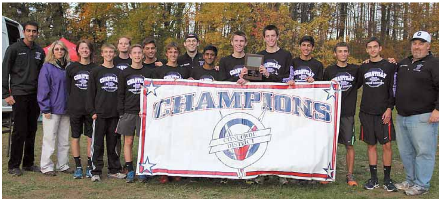
The Chantilly boys won the Conference 5 cross country team title on Oct. 30.

Each of the Chargers' top five produced a