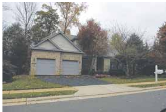
5 12020 Creekbend Drive, Reston — $935,000