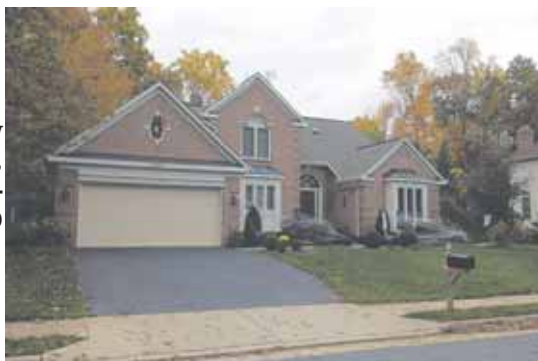
4 3282 Willow Glen Drive, Herndon — $950,000