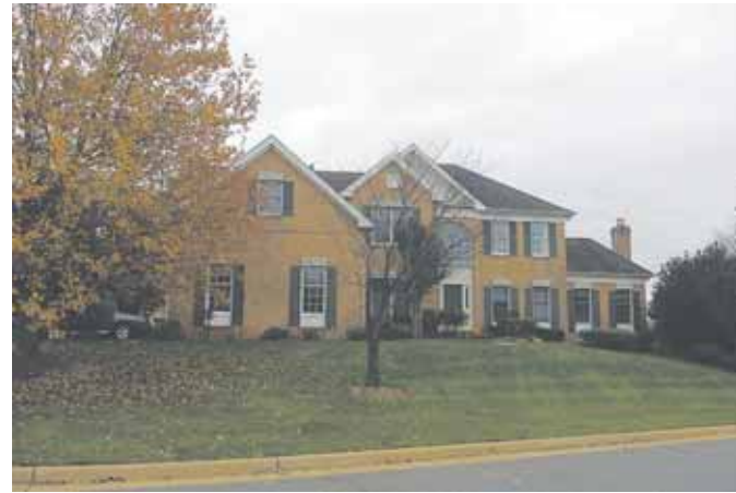
3 1334 Dasher Lane, Reston — $980,000