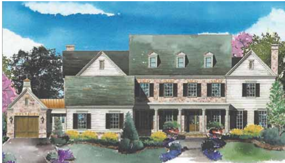
A country estate in McLean is the 2015 location for the DC Design House.