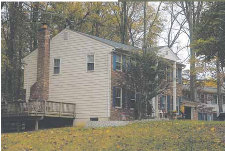
2 12315 Westwood Hills Drive, Herndon — $1,250,000