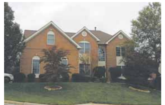
6 12691 Autumn Crest Drive, Oak Hill — $925,000