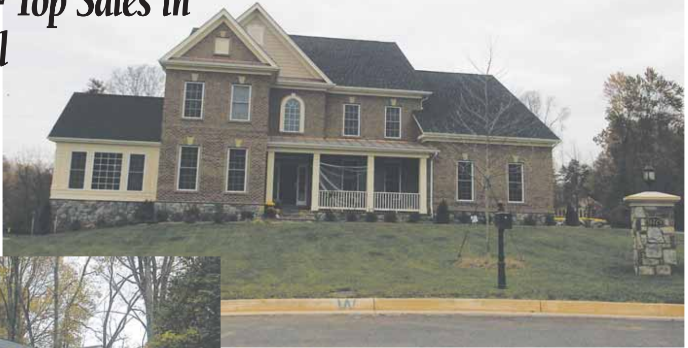
1 11729 Shaker Knolls Court, Herndon — $1,555,843