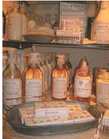
Barr-Co. bath and body products include soaps, lotions, candles, bath salts and bubbles.