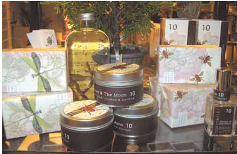
Tokyo Milk perfums, soaps and lotions in complex, multi-layered fragrances.