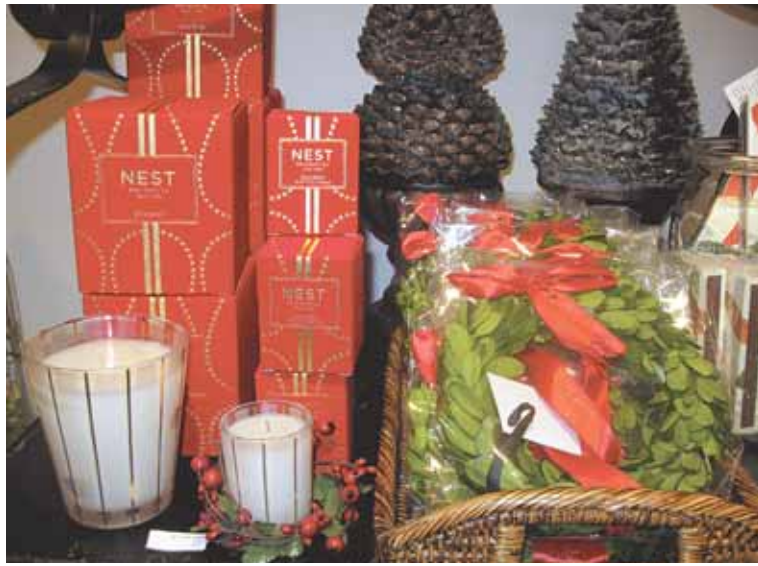
Nest Home fragrance candles and reed diffusers.