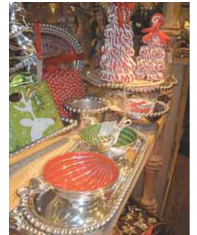
Mariposa serving pieces, frames, and gifts made of 100 percent recycled aluminum.