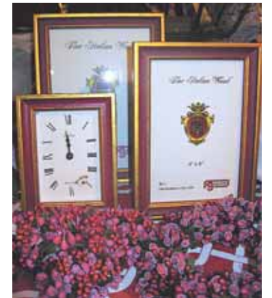
Picture frames with matching clocks made of fine Italian woods and handcrafted in the U.S.