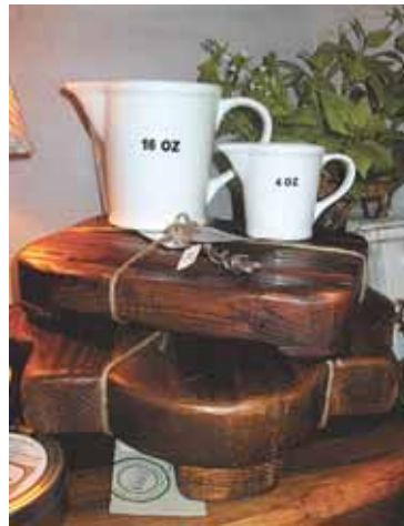
Reclaimed European wood serving trivets and cutting boards.