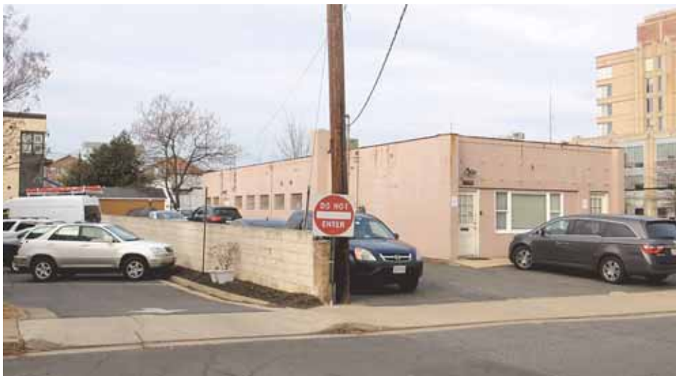
Current Arlington-Alexandria Coalition for Homelessness facility on North Highland Street.