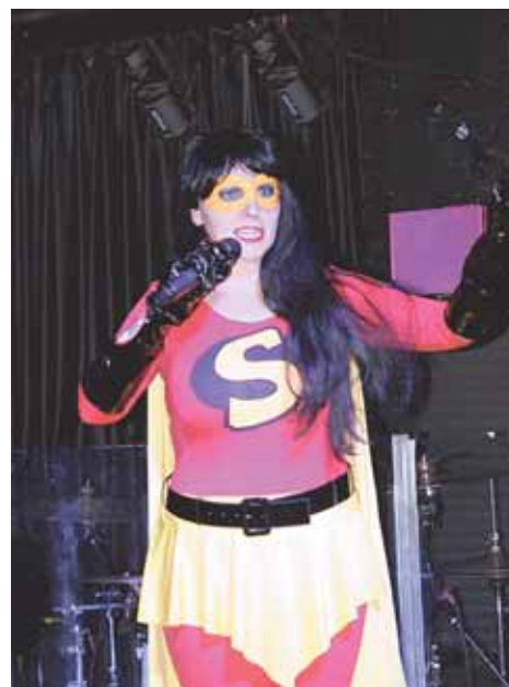
SoberWoman works to stop drunk-driving.