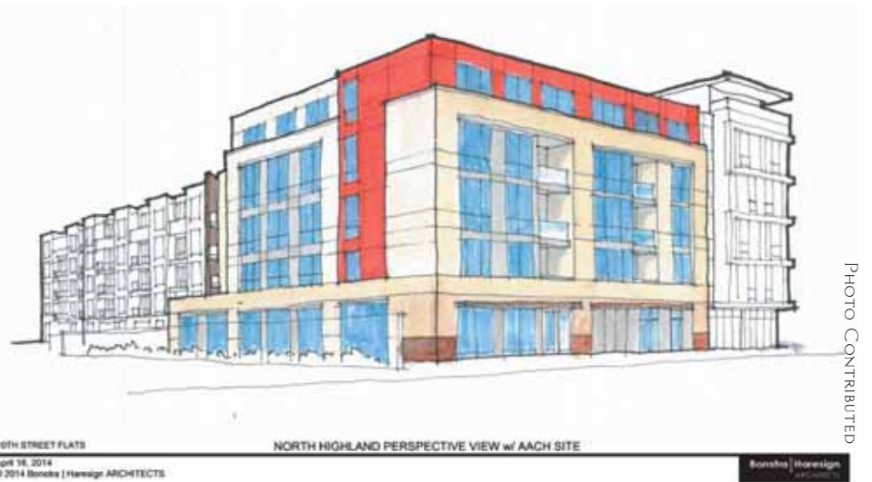
Designs for the new Bridges to Independence facility on North Highland Street.