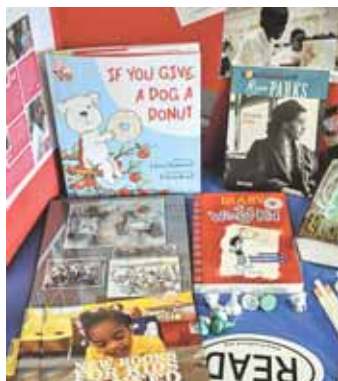
First Book-Northern Virginia provides new books to at-risk children in Northern Virginia.

People's Assistance Network (A-SPAN), Art for Humanity, Bikes For The World, Borromeo Housing Inc., Calvary Children's School, Co-Partners For Campesinas, First Book – Northern Virginia, Homeless Children's Playtime Project, Mason Leach Superstar Fund, MicheLo Program, Reach Out To Haiti and The Holiday Project. Gifts That Give Hope is an opportunity for people to give back to their community and honor their loved ones at the same time. Instead of buying traditional holiday gifts, shoppers donate to local nonprofits and receive a holiday card describing the donation to give as a gift. Online shopping is available until Dec. 20. For more information visit www.giftsthatgivehope.org/arlington .