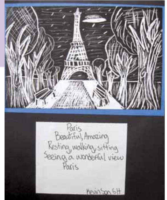
Kevin Son, Greenbriar West Elementary, grade 6