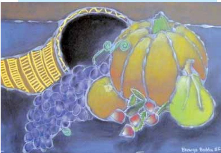
Bhavya Boddu, Greenbriar West Elementary, grade 5