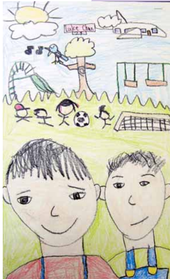
Luke Chan, Greenbriar West Elementary, grade 2