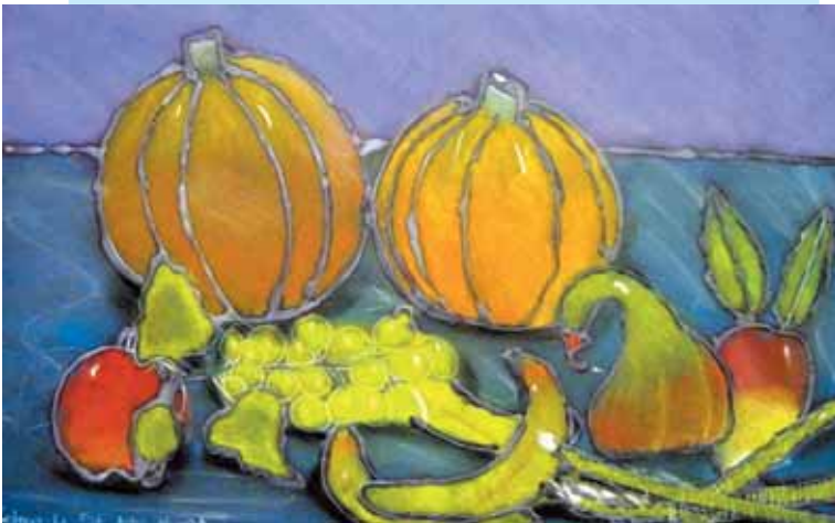
Feileen Li, Greenbriar West Elementary, grade 5