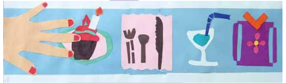
Haley Oeur, Greenbriar West Elementary, grade 3