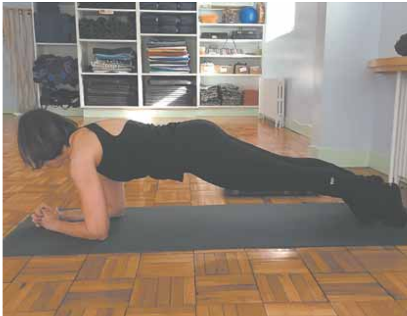
Bodyweight training, which includes exercises such as plank, is the top fitness trend for 2015 according to the American College of Sports Medicine.

Fitness industry pros say yoga is number seven.