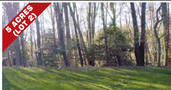
Great Falls $925,000