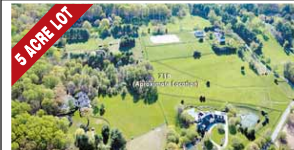
Great Falls 1,250,000