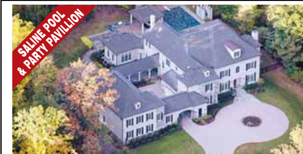
Great Falls $3,999,000