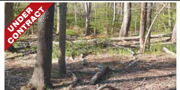
Great Falls $4,500,000