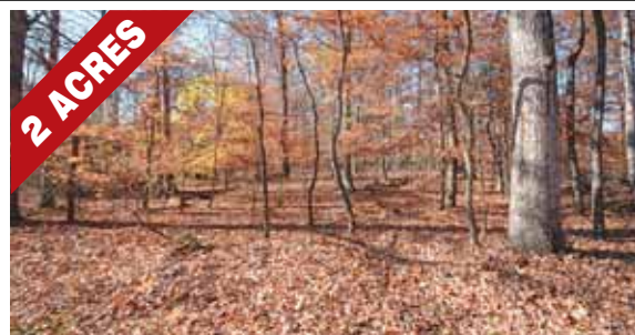
Great Falls $799,000