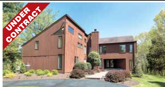
Great Falls $1,197,000