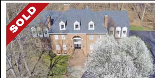
Great Falls $1,775,000