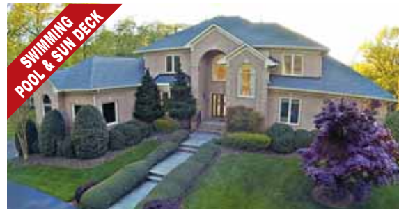
Great Falls $1,599,999