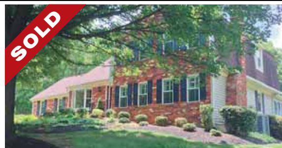
Great Falls $849,500