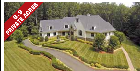
Great Falls $2,999,000