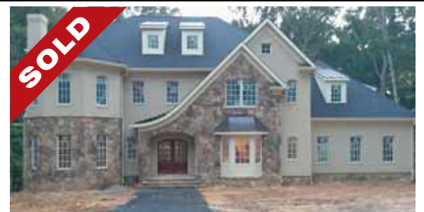
Great Falls $2,450,000