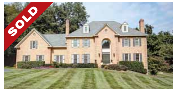
Great Falls $1,790,000