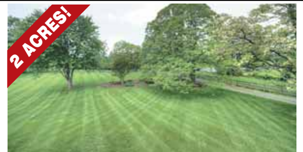
Great Falls $799,000