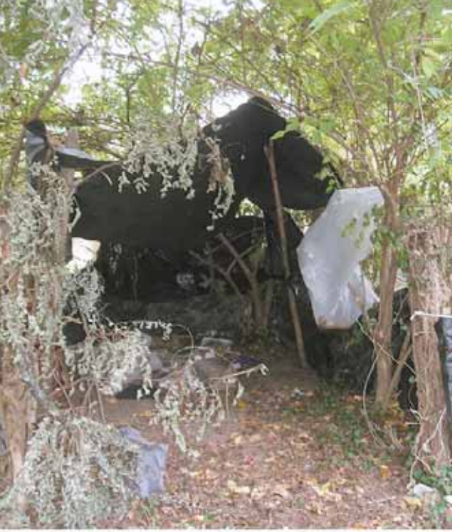
Perennial homeless camps along Quander Brook create unsanitary conditions contaminating the stream with trash and wastes. Such camps are not permitted on Fairfax County Parkland where enforcement keeps such activity in check.

When seeking the transfer of the SEE FUTURE, PAGE 14