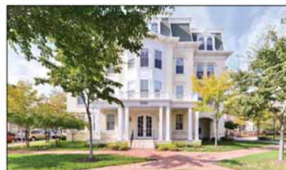
Old Town Alexandria

703.944.7737 | 703.447.6138 www.HomesByHayes.com