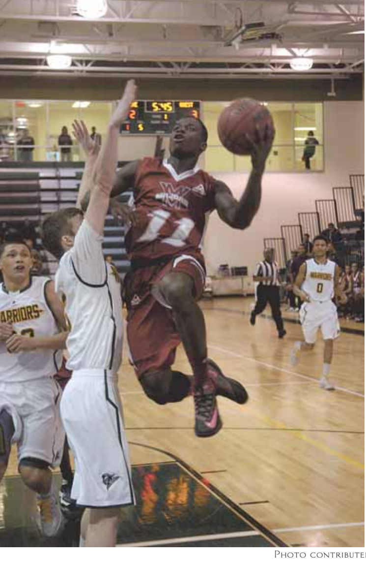
The Mount Vernon boys' basketball team reached the 2014 Conference 13 championship game.