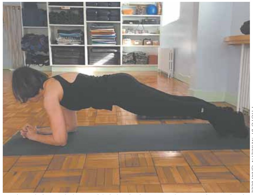
Bodyweight training, which includes exercises such as plank, is the top fitness trend for 2015 according to the American College of Sports Medicine.

Fitness industry pros say yoga is number seven.