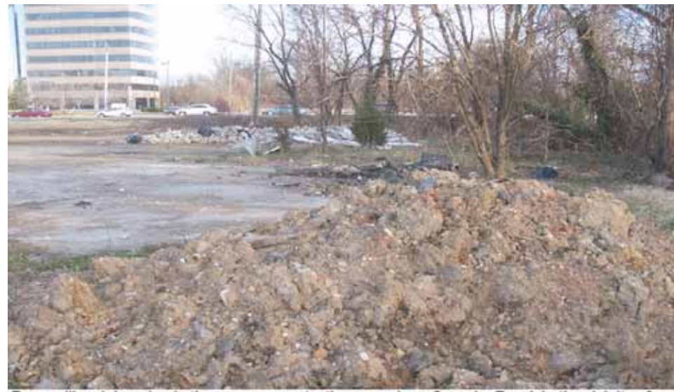
Brazen illegal dumping in the resource protection area along Quander Brook in the vicinity of Fort Hunt Road and U.S. Route 1. This area is the first impression of a ruined landscape visitors to the Mount Vernon area have when coming from Alexandria or the beltway. Who is responsible and pays for the cleanup required to fix this outrageous behavior?