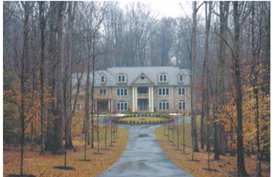
2 7540 Clifton Road, Fairfax Station — $2,250,000