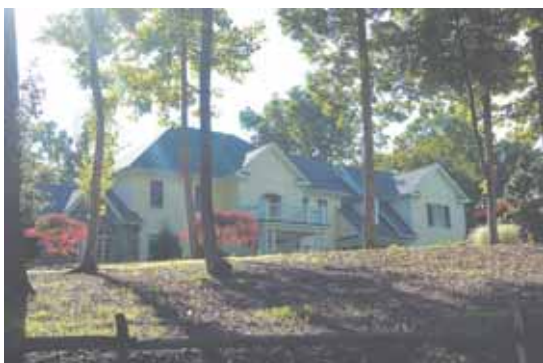
5 7904 Oakshire Lane, Fairfax Station — $1,495,000