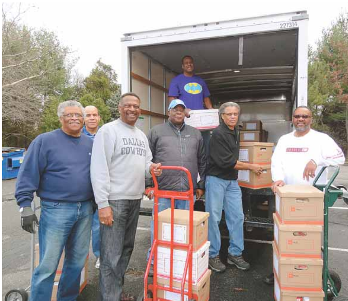
Members of Antioch Baptist Church deliver 90 boxes of food and turkeys for WFCM clients