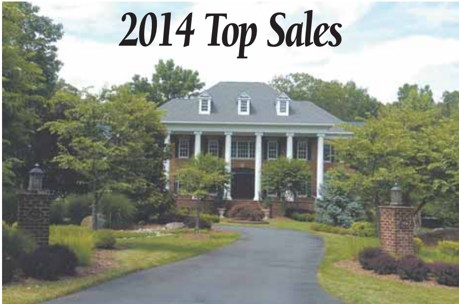
1 15604 Jillians Forest Way, Centreville — $2,650,000