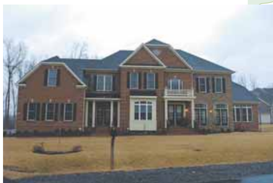
4 11394 Amber Hills Court, Fairfax — $1,423,061