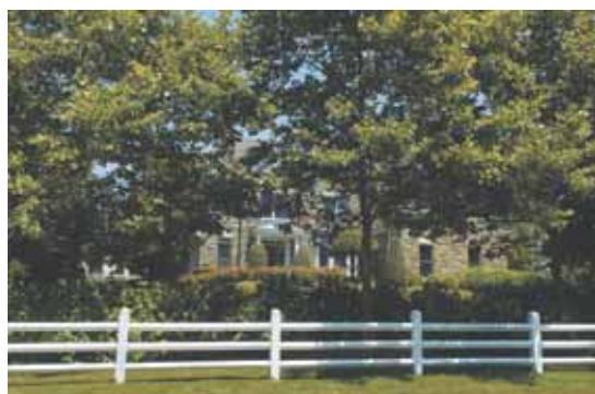
10 3514 Rose Crest Lane, Fairfax — $1,350,000