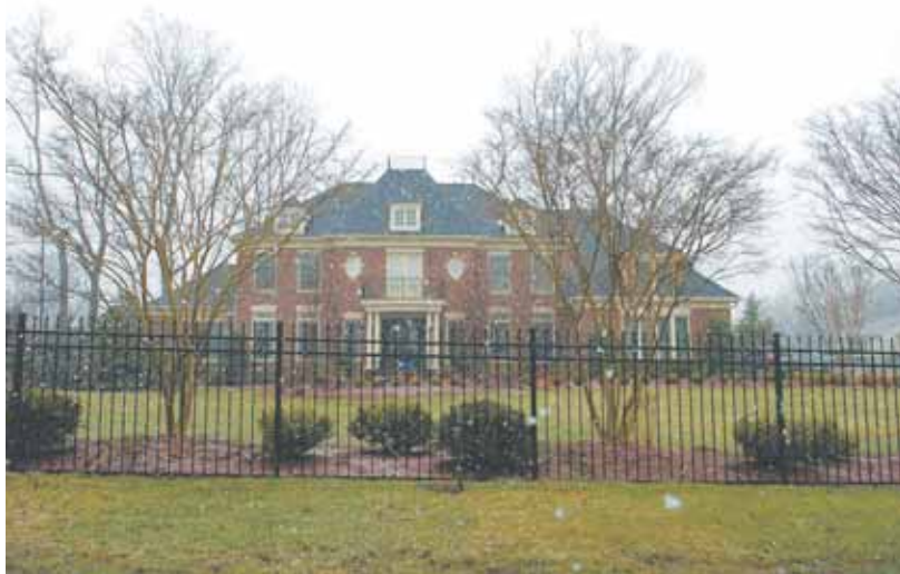
3 3802 Millard Way, Fairfax — $1,700,000