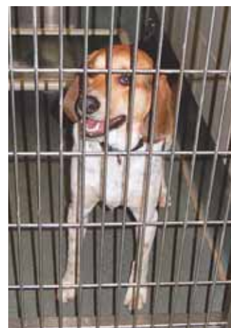
This dog would like a new home.

The Fairfax County Animal Shelter is at 4500 West Ox Road and is open Tuesday through Friday, noon to 7 p.m., and Saturday, 10 a.m. to 5 p.m. For more information, go to http://www.fairfaxcounty.gov/animalshelter .