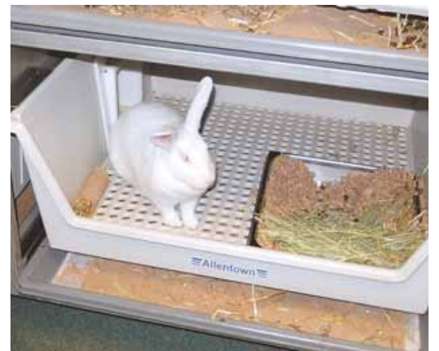
A white bunny in the small-animal room.