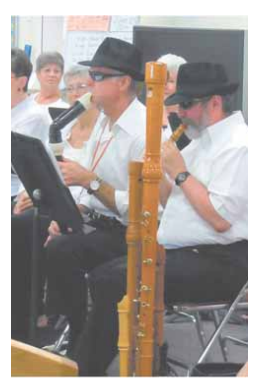
Seniors take part in programs at the Osher Lifelong Learning Institute at GMU.

8 ♦ Vienna/Oakton Connection ♦ Senior Living April 2015