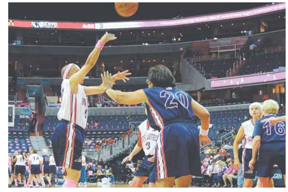
Women of the Nova United, part of the National Senior Women's Basketball Association get exercise with a team sport. They are part of a new fitness trend.

Such fitness classes can help preserve mobility and cognitive function, say re-