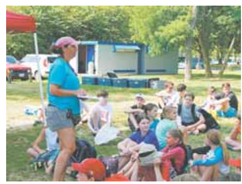
Summer counselors at National Marina Sailing Camp give the sailors a safety lesson each day before heading for the Potomac.

Adventures on a Big Boat sails a Catalina 25. This group has a picnic lunch under anchor on Thursdays and they, along with the intermediate boats, sail to Old Town for