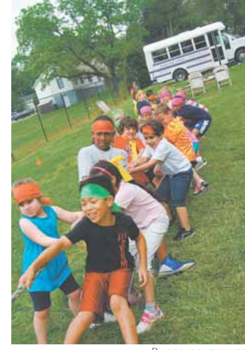
PHOTO CONTRIBUTED Children participate in Field Day at Kenwood Summer Day Camp in Annandale.

Register on the website through the Parent Portal. Centreville Dance Academy is located at 14215-G Centreville Square, Centreville. Visit www.centrevilledance.com, call 703-815-3125 or email office@centrevilledance.com.