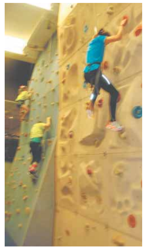
Photo contributer Campers enjoy the rock climbing wall at Burke Racquet and Swim Club's Sports Camp.

"At Burgundy Farm Summer Day Camp, our campers enjoy all the benefits of a sleep-