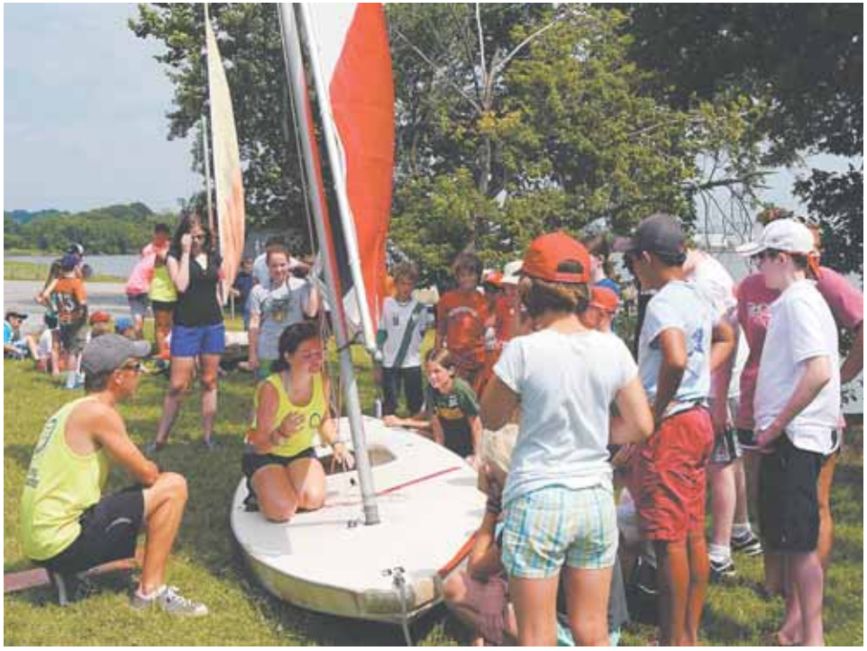
Sailors rig the Sunfish in preparation for beginning the day's lesson at Youth Sailing Camp at the Washington Sailing Marina.