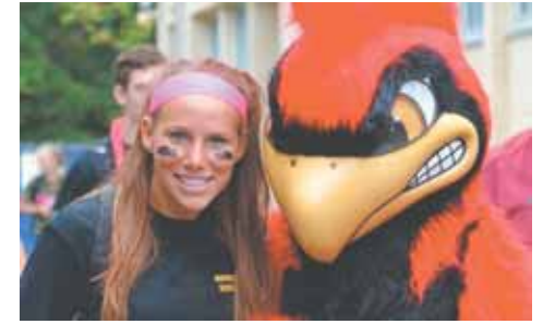
Bishop Ireton Cardinals summer camps in Alexandria are gearing up for their eighth year of sports and theater camps.

St. Stephen's & St. Agnes SummerTimes programs offers campers ages 3-18 an enjoyable and enriching experience with programs designed to stimulate curiosity and creativity, develop talents, and encourage exploration and personal growth. Most of the camp directors are SSSAS teachers and