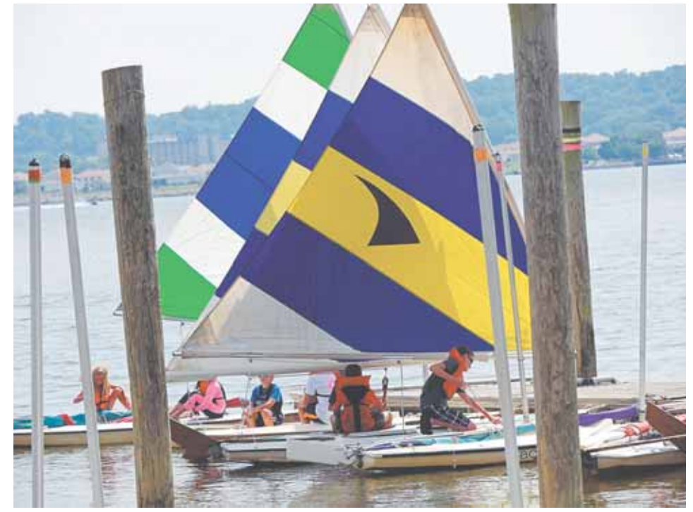
Beginning Sunfish classes sail from the dock on a summer morning to practice the day's maneuvers.