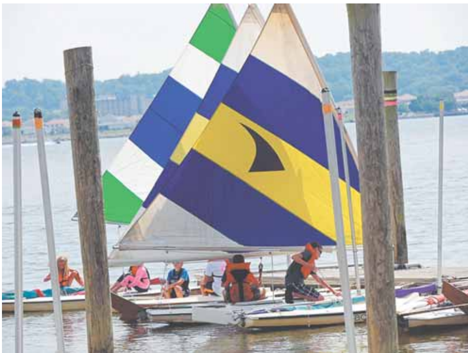
Beginning Sunfish classes sail from the dock on a summer morning to practice the day's maneuvers.