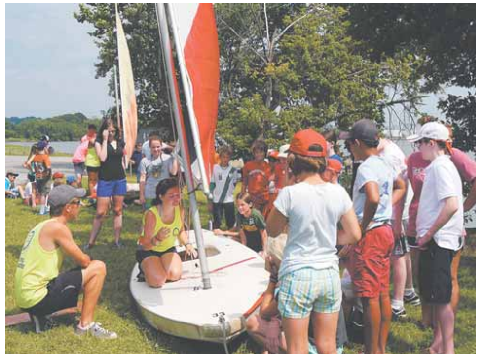
Sailors rig the Sunfish in preparation for beginning the day's lesson at Youth Sailing Camp at the Washington Sailing Marina.