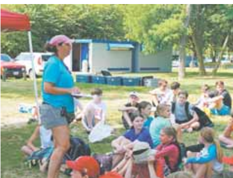
Summer counselors at National Marina Sailing Camp give the sailors a safety lesson each day before heading for the Potomac.

Adventures on a Big Boat sails a Catalina 25. This group has a picnic lunch under anchor on Thursdays and they, along with the intermediate boats, sail to Old Town for