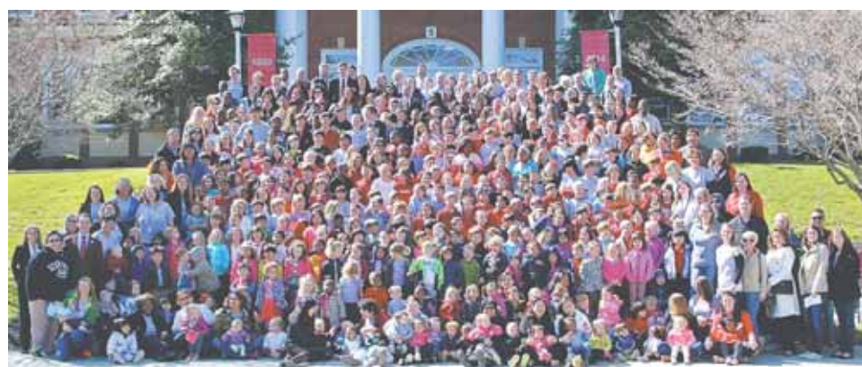
Celebrating a 75th anniversary.