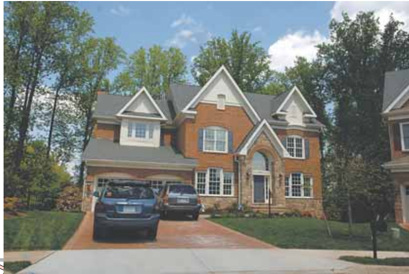
3 3423 Preservation Drive, Fairfax — $1,252,065