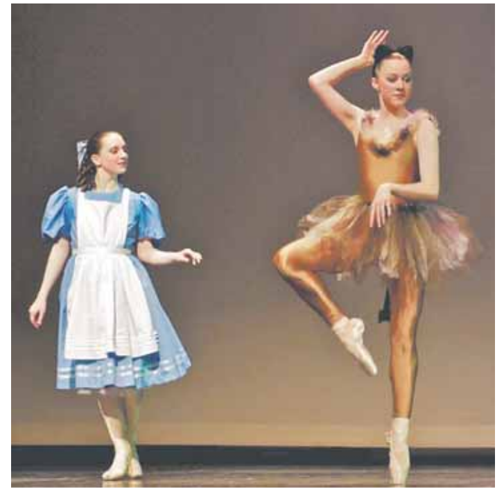
The Fairfax Ballet will perform "Alice in Wonderland" May 30-31. Visit www.fairfaxballet.com for more.

❖ SOL Test Only. This program is for FCPS seniors who plan to graduate