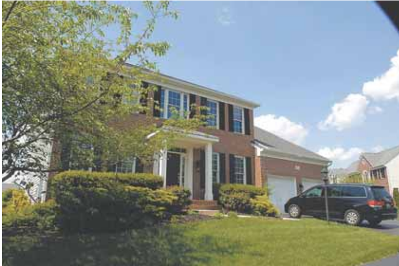
6 3611 Rocky Meadow Court, Fairfax — $897,000