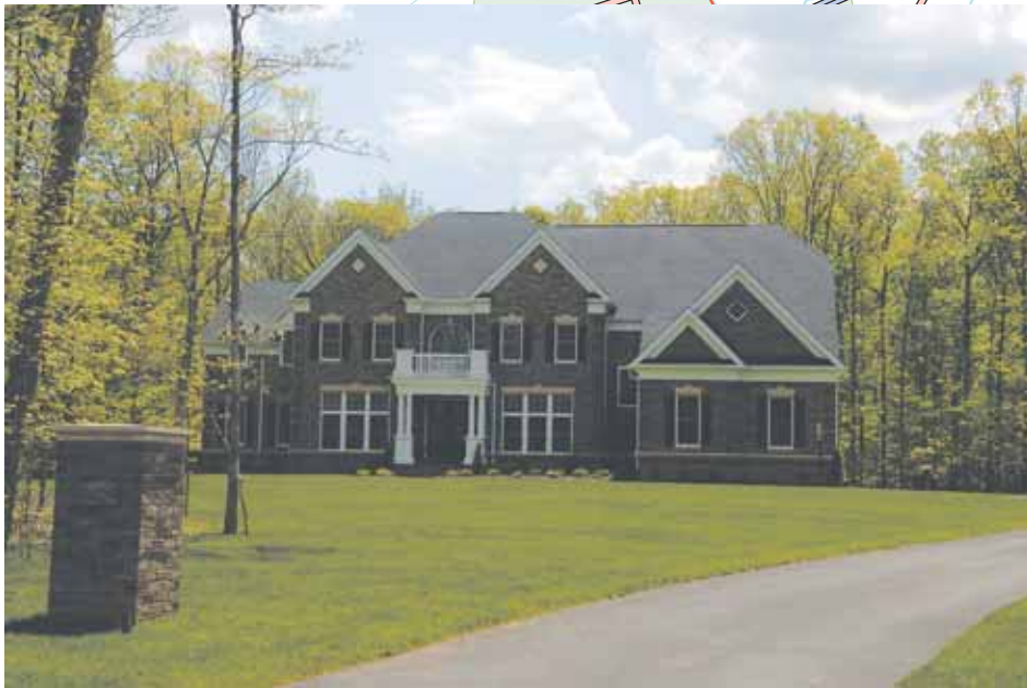
2 15629 Jillians Forest Way, Centreville — $1,475,141