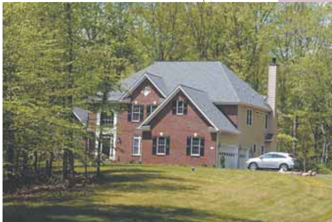
5 8108 Spruce Valley Lane, Clifton — $995,000