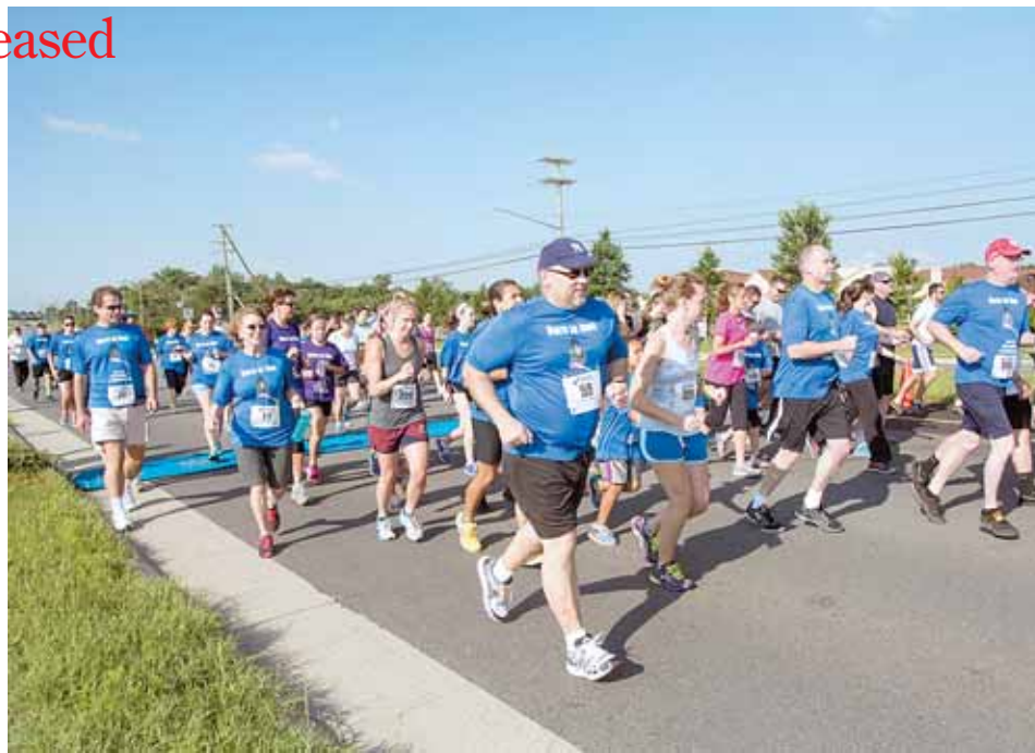
Some of the participants in last year's 5K race.