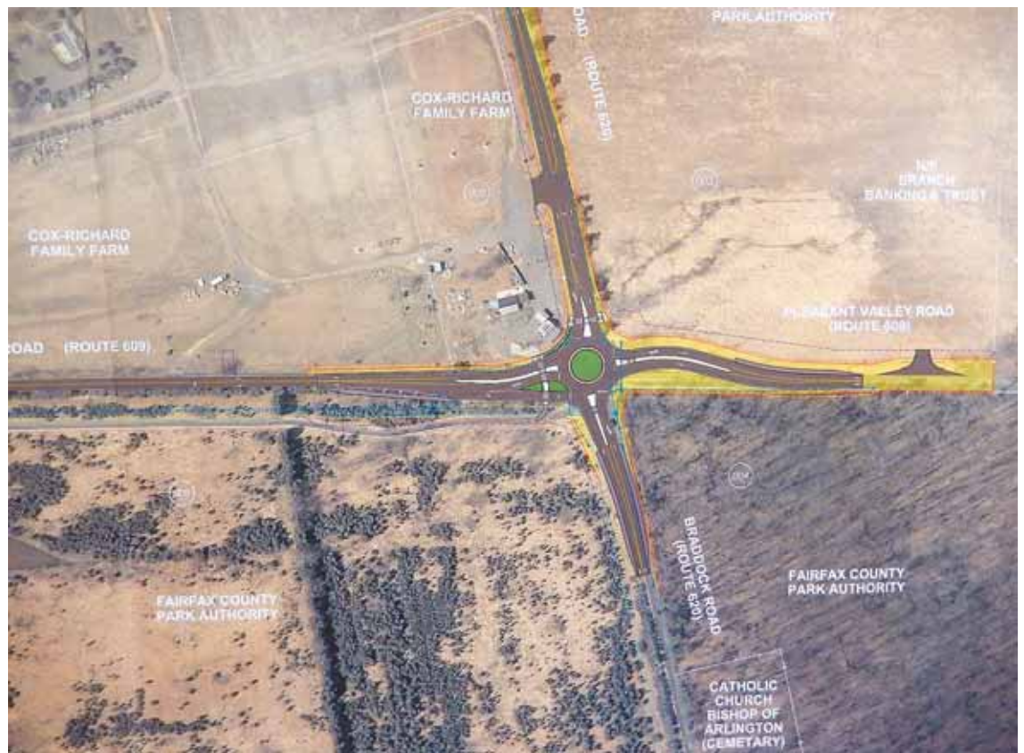
VDOT's new map of the roundabout being built at the Braddock /Pleasant Valley roads intersection in Centreville.