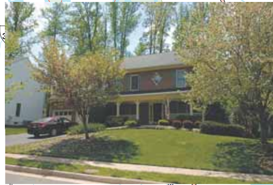
7 6326 Wilmington Drive, Burke — $890,000