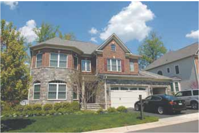
8 12606 Winter Wren Court, Herndon — $1,200,000