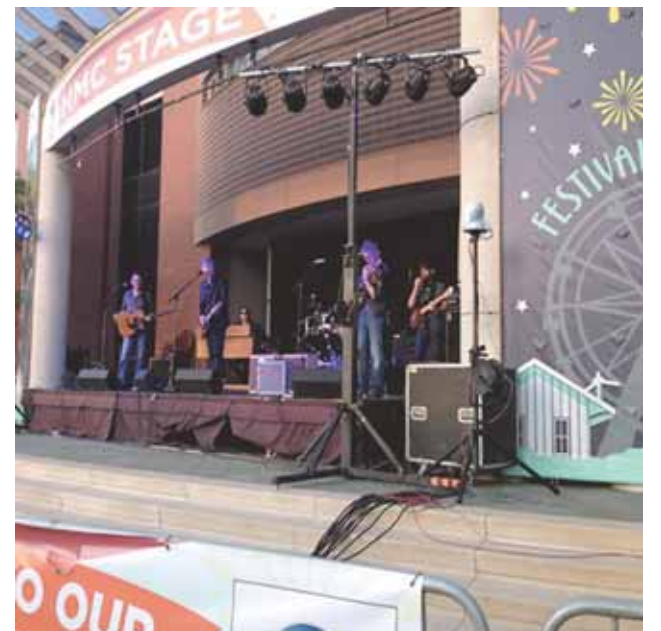
Festival hours are: Thursday, May 28, 6 - 10 p.m.; Friday, May 29, 5 - 11 p.m.; Saturday, May 30, 10 a.m. - 11 p.m.; and Sunday, May 31, 10 a.m. - 6 p.m.