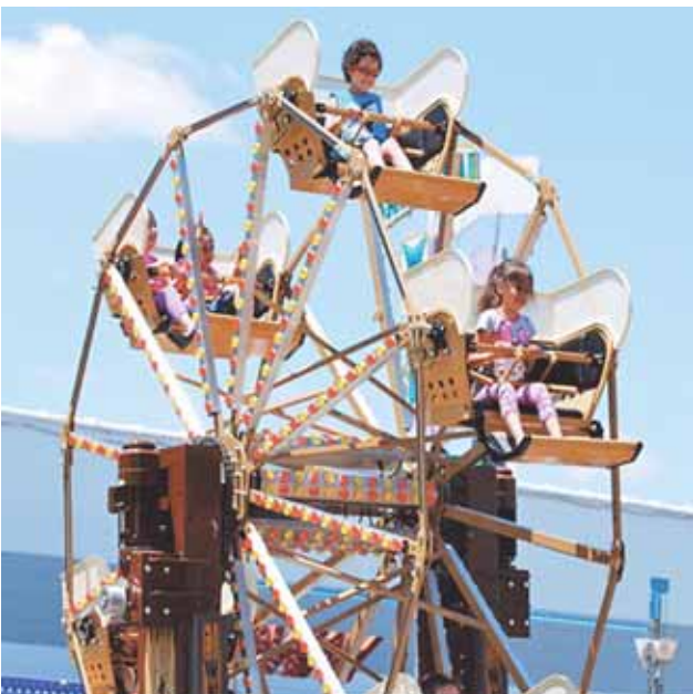
Carnival Rides are traditionally one of the most popular festival attractions.