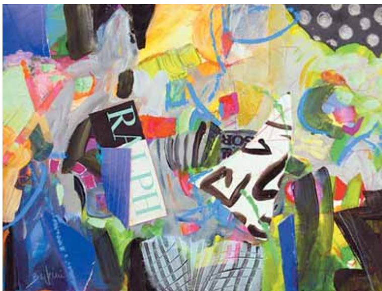
PAINTING BY ANN BARBIERI

Bike to Work Day...Reston Pit Stop. 6:30 - 9 a.m. The Plaza at the Wiehle-Reston East Metrorail Station. Comstock Partners and Reston Association invite you to join more than 450 local commuters for a celebration of bicycling as a clean, fun, and healthy way to get to work. Register and receive a free T-shirt, enjoy light refreshments, and be entered into a raffle for a free bicycle! This great location is above Fairfax County's first secure bike parking facility, just blocks from the W&OD Trail. Contact Ashleigh@reston.org or call 703-435-6577. Register at http://www.biketoworkmetrodc.org