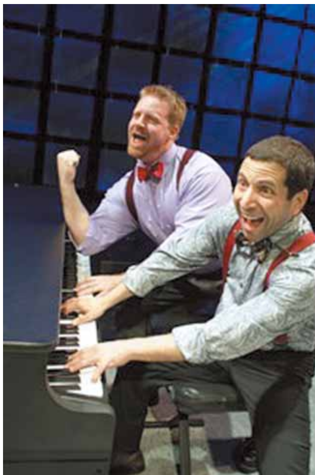
Thursday, May 28, performances feature the music of Dueling Pianos.