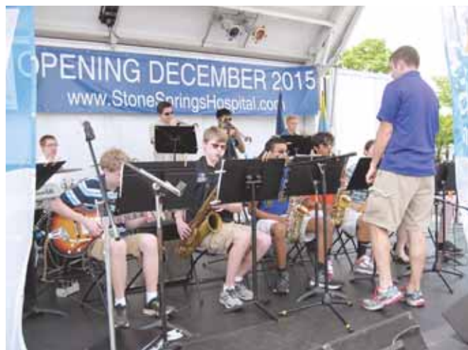
The Chantilly High School Jazz Band performs.