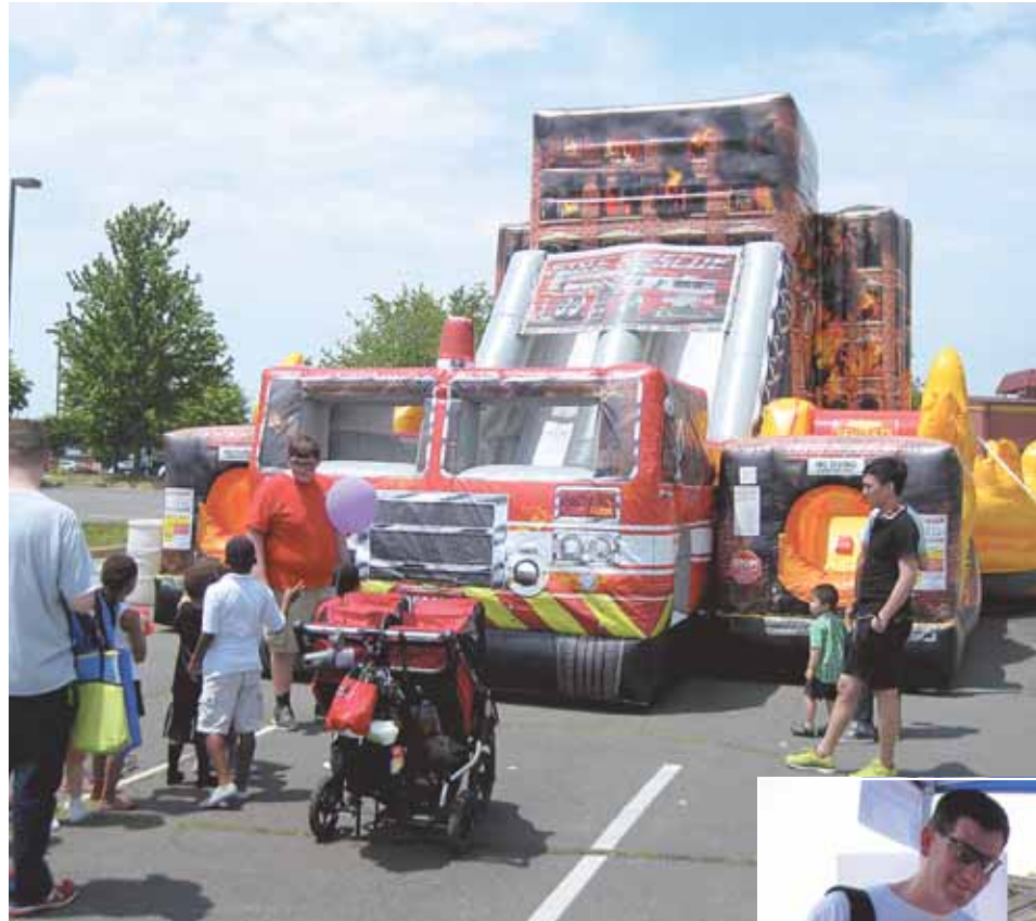
Children line up for the Inflatable Fire House Obstacle Course ride.