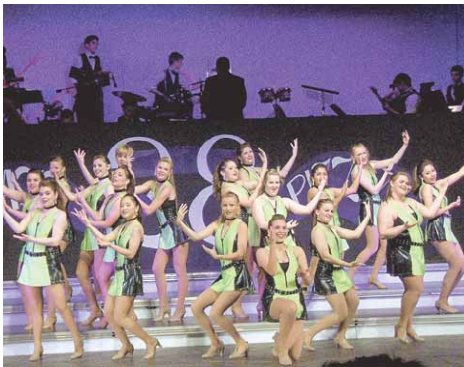
Chantilly ShowStoppers perform “Wings” during last year’s Jazz & Pizzazz.