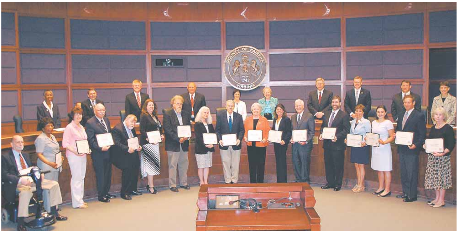
The Board of Supervisors named the 2015 Lords and Ladies Fairfax on Tuesday, May 12.