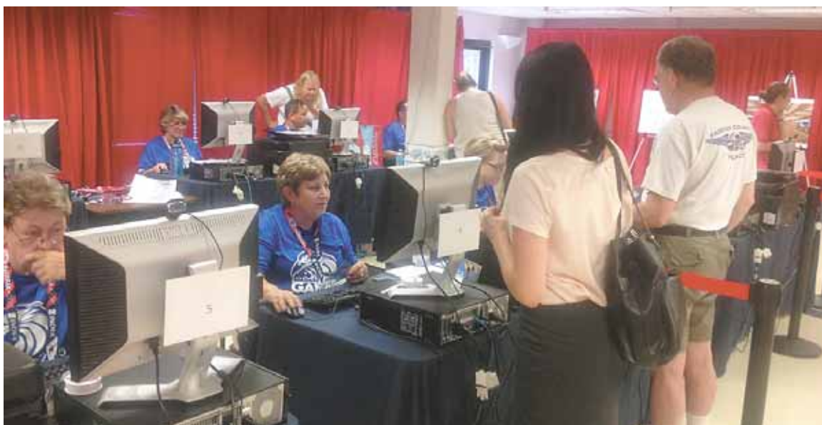
Volunteers have been registering to assist at the 2015 Fairfax World Police and Fire Games at 1800 Cameron Glen Drive in Reston. More than 10,000 police and fire rescue personnel from all over the world will compete in the games, which run from June 26 to July 5 at locations in Fairfax County.