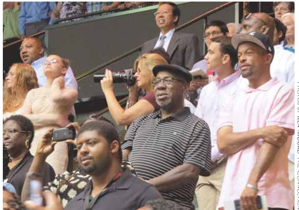
The South Lake Chorus sang “Star Spangled Banner” by Francis Scott Key and “I Was Here” by Diane Warren.