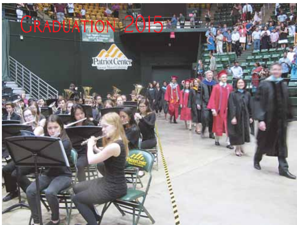
Herndon's Class of 2015 enters George Mason University's Patriot Center for its commencement ceremony.