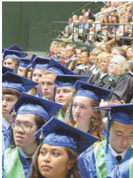
Students watch classmates walk the stage.

“Wherever your next steps may take you, notice the little moments,” he said. “The small moments ... bring out the flavor we never expected.”