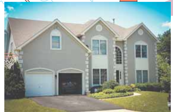
9 12711 Hunt Manor Court, Fairfax — $910,000

COPYRIGHT 2015 REAL ESTATE BUSINESS INTELLIGENCE. SOURCE: MRIS AS OF JUNE 15, 2015.