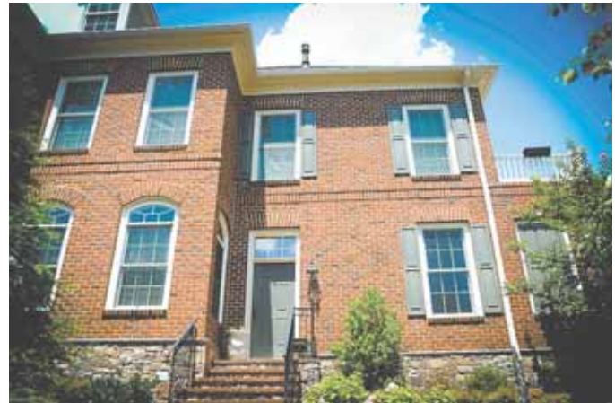
6 10645 Yorktown Drive, Fairfax — $1,050,450