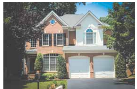
10 10094 Daniels Run Way, Fairfax — $900,000