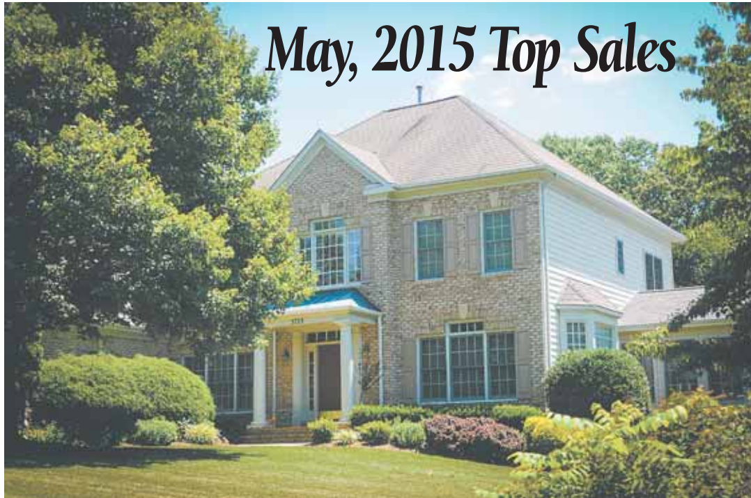
4 5753 Daingerfield Way, Fairfax Station — $1,120,000