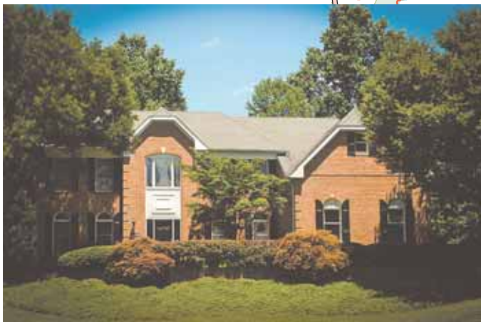
8 6203 Halley Commons Court, Fairfax Station — $980,000