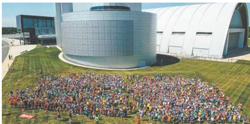
Campers in the Fairfax County Park Authority’s REC-Pac summer program gather to break into the Guinness Book of World Records.

The Family Life Education Curriculum Advisory Committee meets twice yet this year — Oct. 8 and Nov. 12 — at the Gatehouse Administration Center from 7-9 p.m.