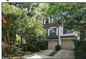
Burke Centre • $400,000 • Garage TH • Backs to Common Area