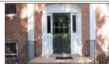
Fairfax City $190,000 You are minutes away from shopping, restaurants, and Metro service! This two bedroom condo is perfect for first time owners but equally appealing if you are downsizing. Freshly painted, new appliances, and new neutral carpet throughout.

Access the Realtors Multiple Listing Service: Go to www.searchvirginia.listingbook.com