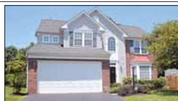
Woodbridge $500,000 Stylish Updates Beautiful 4 BR, 3.5 BA home w/open flrpln. New HW floors on ML. Gourmet Kit w/SS appliances. Gas FP. Fin. Rec Rm w/WO from Lower Level. Backs to Trees.