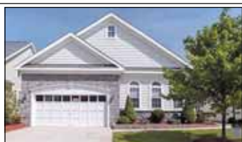
Gainesville Heritage Hunt 55+ $479,900 GORGEOUS 2 LVLS on golf course - STUNNING Sunrm addtn. 3BR, 3.5BA, Grnt Kit w/ maple/grnt & islnd, Liv, Din, Fam w Gas Fpl, Sunrm, Loft, 2 car Gar, Irrig syst, Patio.