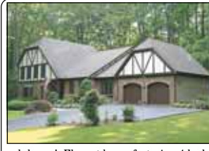
Fairfax Station/ Canterberry Estates Coming Soon! $769,500

Rare opportunity! 1.5 beautiful, landscaped acres sited on a cul-de-sac! Elegant home featuring 4 bedrooms, 3 full baths - kitchen & all baths updated - possible (true) 5th BR with bath on main floor - large custom screen porch with adjacent deck - butler's pantry - MBR with sitting room + dressing area - ample closet space - many built-ins - many surprises!