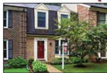
Springfield • $399,900 • Pottery Barn Cute, • Backs to Trees