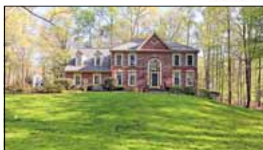
Fairfax Station Beauty - $869,000 Sited on 1 acre with gorgeous landscaping. Beautifully updated with attention to details throughout!

Charming 4 Bedroom/ 3.5 Bath colonial in terrific community! Sunny and updated throughout!