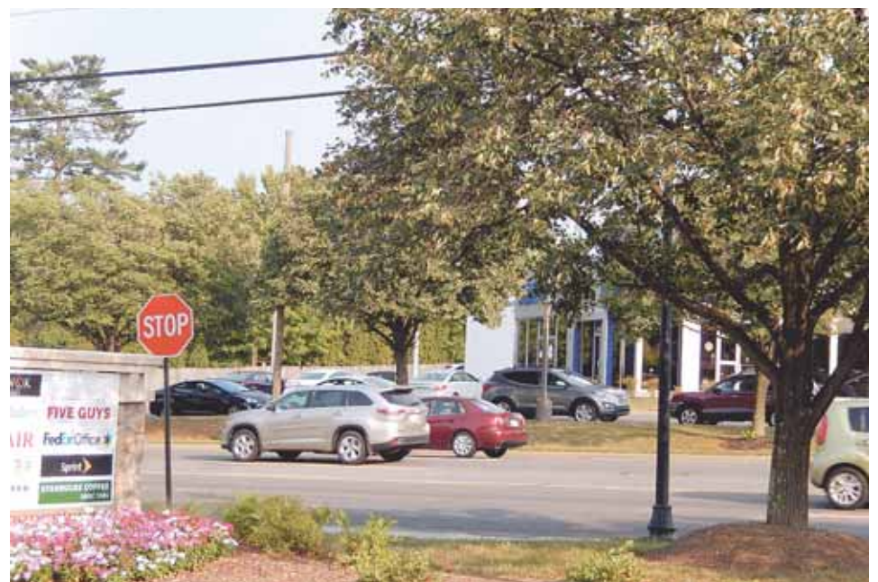
A section of Fairfax Boulevard in front of the Fairfax Marketplace shopping center.