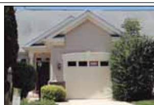
Gainesville Heritage Hunt 55+ $279,900 UPDATED 1 LVL patio home - backs to trees! 1 lg BR w WIC, 1.5 BA, Kit w oak cabs, recess lts, HVAC 2013, solar tube, ceram tile, Laundry, Liv, Din, Fam, Sunrm, NEW paint, 1 car Gar w NEW door, Patio, close to Clbhs & entry gate.