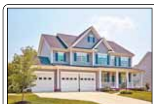
Woodbridge $644,000 Look No Further

Stunning, exquisite, model home condition! 5300+ sq ft. 6BR/5.5BA. 3-car gar. Gorgeous 1/2 ac lot backing to trees. Screened porch & deck. Sunrm off KT. Custom built-ins in fam rm. Library. To-die-for KT w/miles of granite. Sumptuous MBR w/lux bath & BIG walk-in closet. All BR's up w/baths. Expansive walkout rec rm + 6th BR, full bath, media rm on LL. A MUST SEE Call Jim Fox 703.755.0296