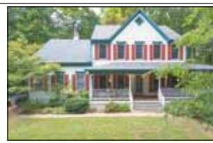
Manassas $525,000 Gorgeously updated, immaculate home on private 1 acre wooded lot in serene community. Gourmet Kitchen, top-of-the-line upgrades: Counters, Cabinetry, Stainless Steel Appliances & Lighting. Fully Finished Walk-Up Basement with Den, Full Bath, Wetbar & new Carpet. 3 year old Roof, new HVAC & new Gutter Guards.