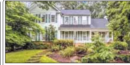
Centreville $629,999 Superbly priced!! From the lemonade sippin' front porch, to the island kitchen, the vaulted ceilings, and the sought after Chantilly HS pyramid - this home offers everything you are looking for at a sensational price. Call for a private appointment.