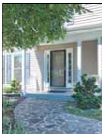
Sequoia Farms - Centreville $520,000

Charming 4 Bedroom/ 3.5 Bath colonial in terrific community! Sunny and updated throughout!