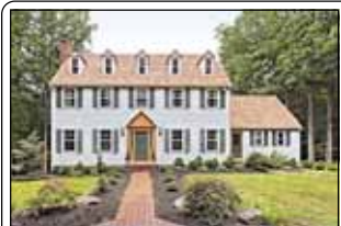
Clifton $900,000 Horse Country!!!

5 bedrooms, 3.5 baths on 5 acres! Premium private lot at end of cul-de-sac next to entrance of bride trails of horse community! Immaculate condition w/ loads of extras/upgrades to include: hardwood floors throughout, granite countertops, SS. 6 stall stable w/ 2 fenced paddocks. 3 fireplaces, cedar shake roof, chair rails/crown molding, and much MORE! Call Steve Childress NOW... 703-981-3277