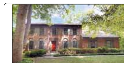
Manassas $635,000 Stunning, center hall 4+ BR, brick colonial, beautifully situated on 5+ acres; custom upgrades, gourmet designer kitchen, library can be bedroom, split rail fence, near historic Clifton, patio & deck, great location, close to VRE!