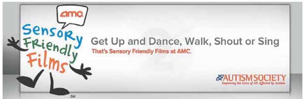
AMC Sensory Friendly Films Promo