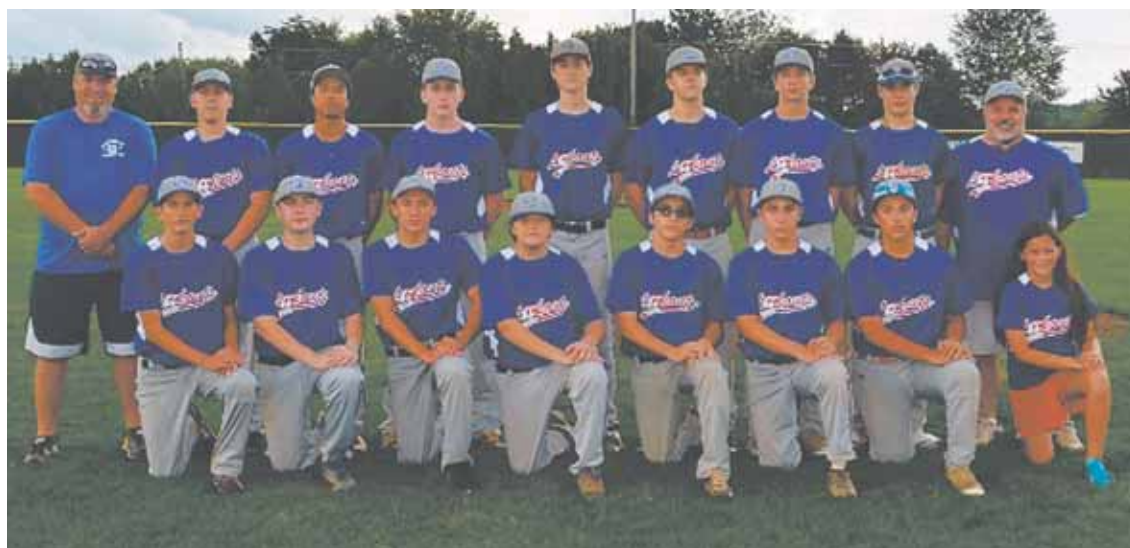
The SYA 13-15 year-old tournament team reached the Southeast Regional final.