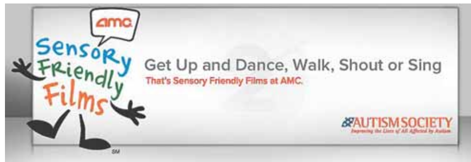
AMC Sensory Friendly Films Promo

July is the hottest month for Hollywood's cavalcade of blockbuster films, as studios compete for audience dollars and crash into each other to be the first to release their tent pole films, such as Avengers, Jurassic World, Mission: Impossible – Rogue Nation, and Fantastic Four.