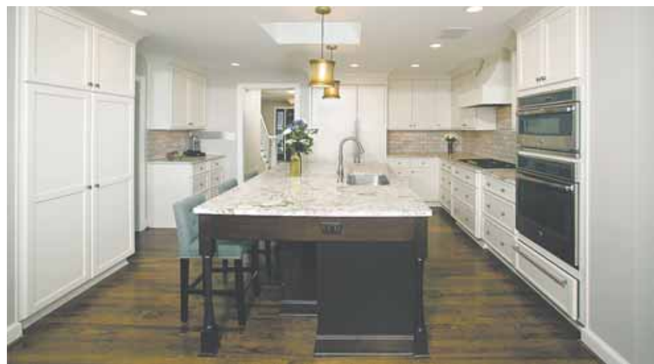
Sun Design's “transitional”-style interior design solution concentrates on pleasing contrasts. The 3.6-foot-by-8-foot cook top island and three stool dining counter features a walnut-colored base topped with a granite surface. The dark-stained oak flooring is offset by ivory-hued paneling that wraps a two-door refrigerator, a roll-out pantry and drawers custom-designed to satisfy the cook's requirements.

In short order, Lataille and the clients