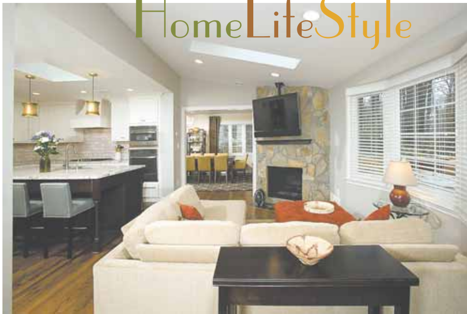
Sun Design's Roger Lataille proposed a stacked stone hearth for a sitting area adjacent to the open kitchen. The textural vertical accent — evoking a cabin-like ambiance — creates an invitation to sit and interact that had previously been missing from a nondescript corner.