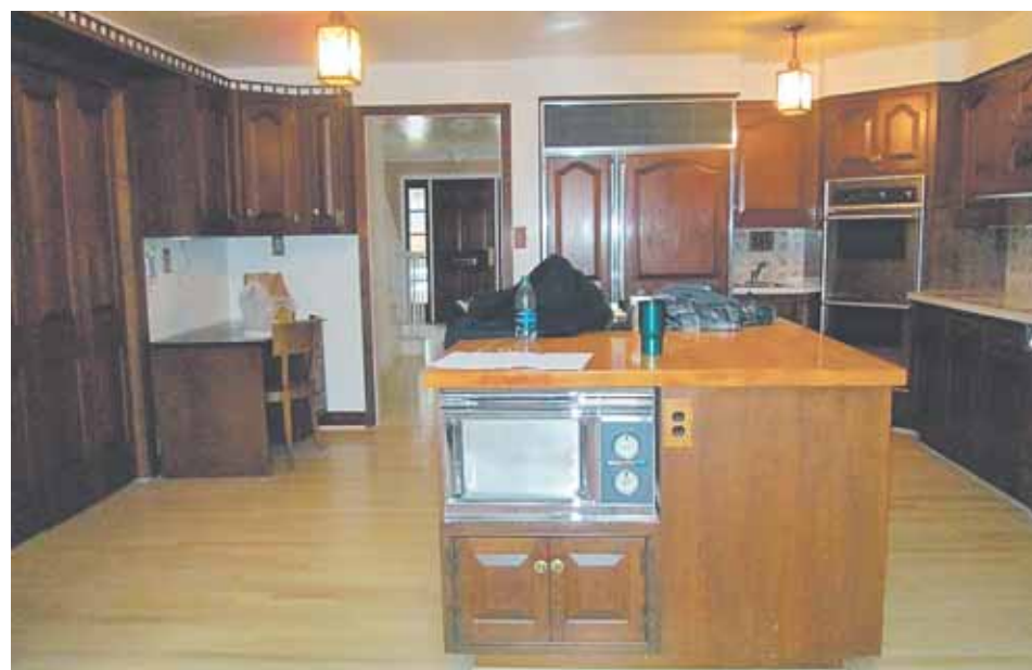
BEFORE: The existing kitchen's dated Colonial accents included Dutch-style maple cabinet facings, a mosaic tile back splash and a vinyl counter surface.

walked through the house and — before any decision had been reached regarding a possible purchase — the designer developed preliminary sketches depicting several remodeling scenarios.