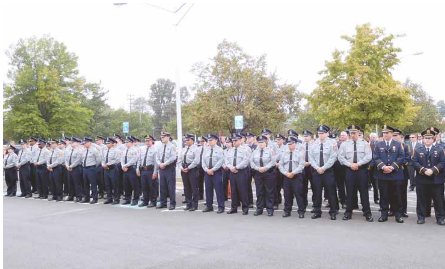
Police officers line up outside the funeral home, waiting for their colleague’s casket to emerge.