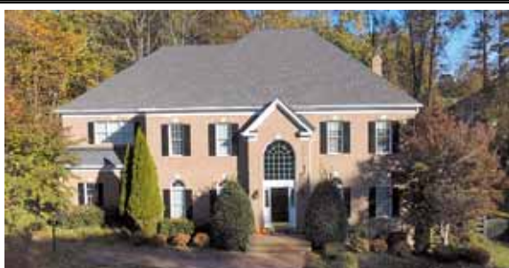
Great Falls $1,879,000