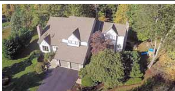
Great Falls $1,299,000