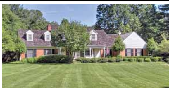
Great Falls $1,199,000