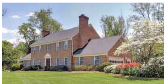
Great Falls $1,249,000