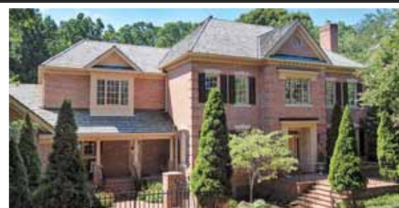
Great Falls $1,525,000