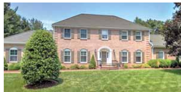
Great Falls $1,350,000