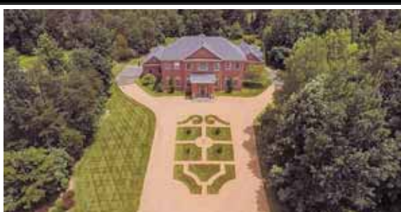
Great Falls $2,375,000