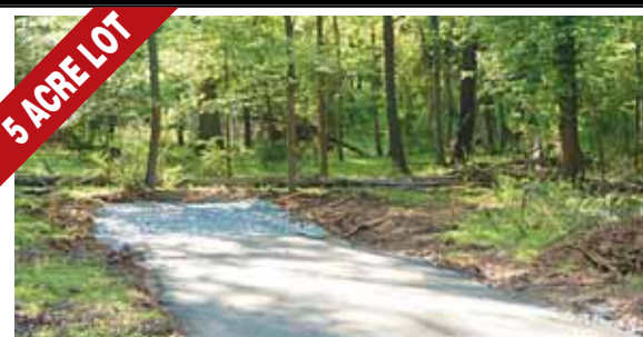
Great Falls $795,000