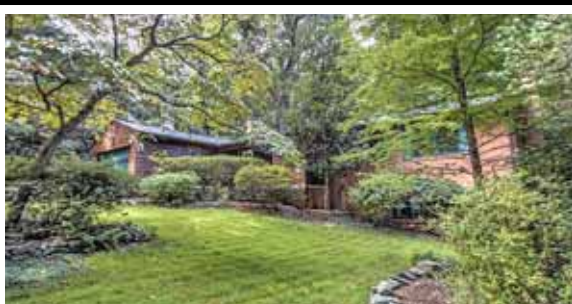
Great Falls $760,000