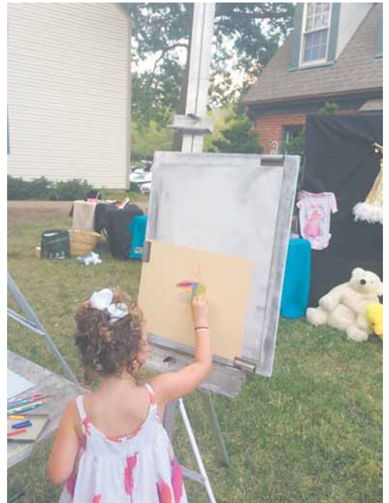
Children had the opportunity to draw using artist easels and art materials.