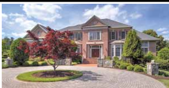
Great Falls $2,050,000