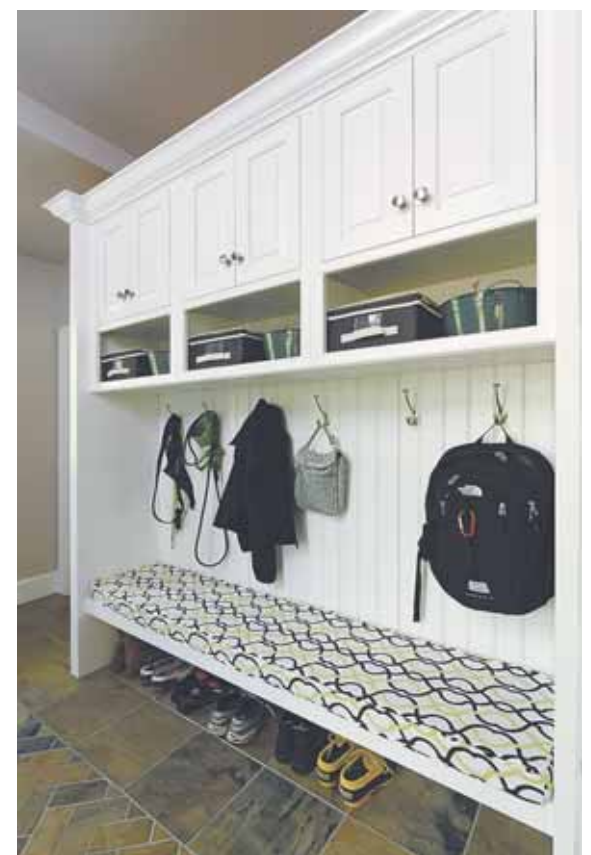
Custom designed cabinetry in this renovated family foyer in Great Falls keeps a busy family organized.