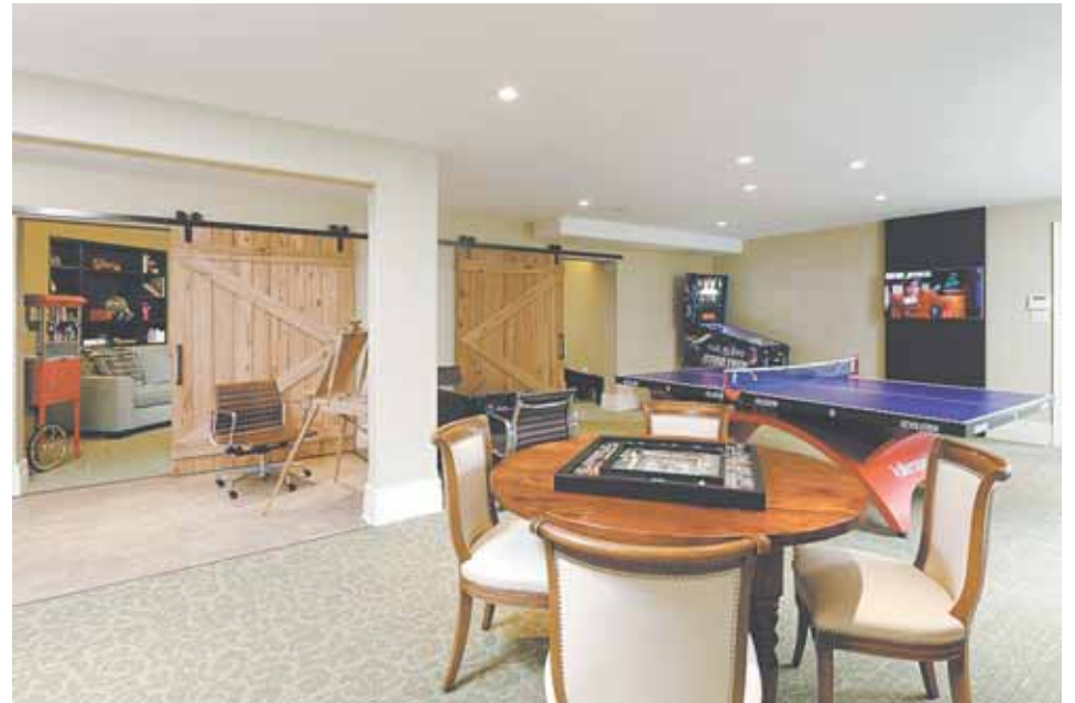
BOWA basement renovation includes space for arts & crafts, games and media.