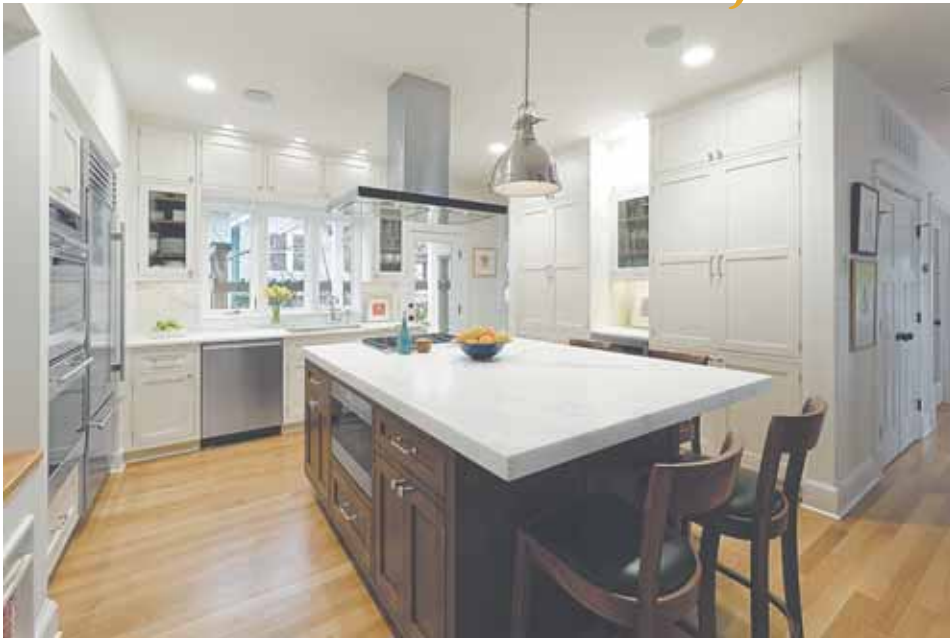
BOWA kitchen renovation in Arlington features under-counter microwave and beverage center.