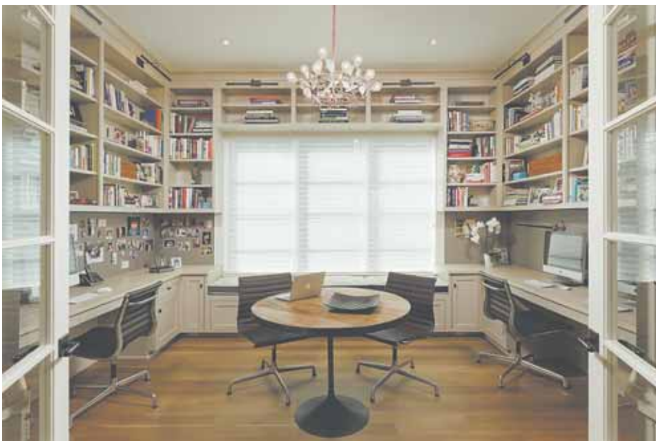
Renovated home office by BOWA features space for the whole family.