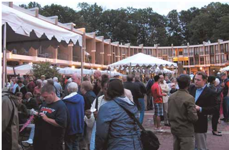
About 500 people filled Lake Anne Plaza last Friday night for a candlelight vigil to remember and celebrate Simon's gift to and of Reston.