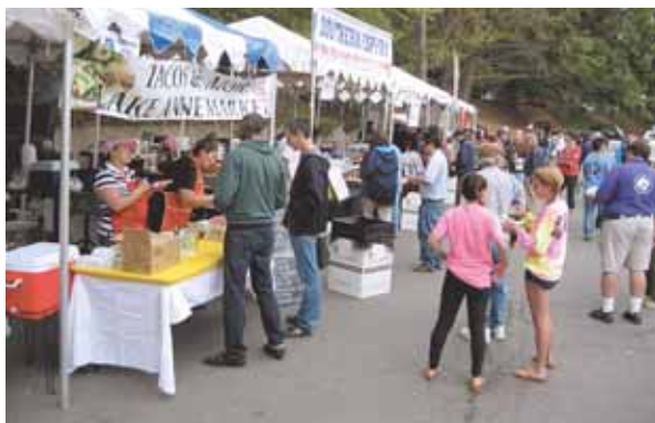
Patrons line up at the concession stands during the Reston Multicultural Festival last Saturday.