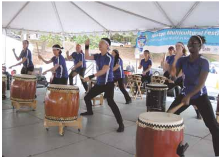
The Mark H. Taiko School presents Taiko Drums or Japanese drumming on the Global Stage during the Reston Multicultural Festival last Saturday at Lake Anne Plaza.