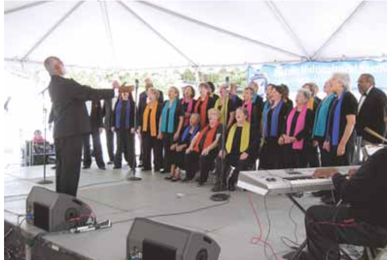
The Mosaic Harmony Gospel Choir performs during the Reston Multicultural Festival last Saturday.

The three choirs will sing African American inspirational music from songs that brought hope and sustenance to slaves as they longed for and made their way to freedom to songs that inspired freedom fighters of the Civil Rights movement, Overton