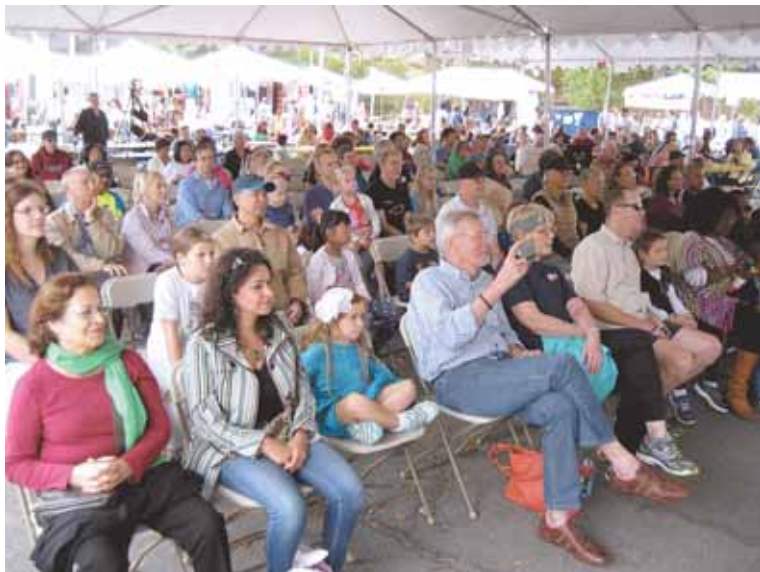
The crowd at the Global Stage during the Reston Multicultural Festival last Saturday.