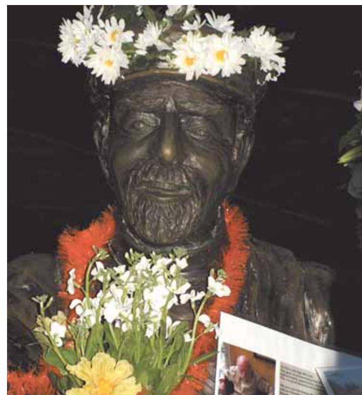
Every day, Simon's statue is adorned with gratitude and flowers.

Veatch and Kane gave voice to the social experiment of a planned community that welcomed all people of all backgrounds and all economic situations.