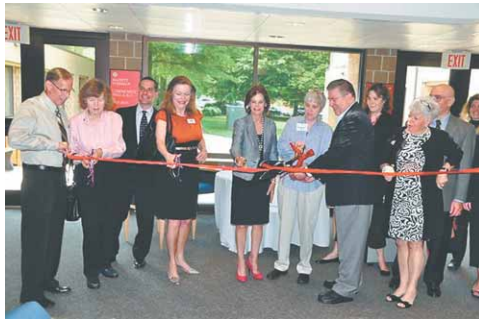
Local officials and volunteers cut the ribbon for the new McLean Senior Source help desk at McLean Community Center on May 15, 2013.

The Fairfax County Long Term Care Coordinating Council provides guidance to those in the county who are interested in