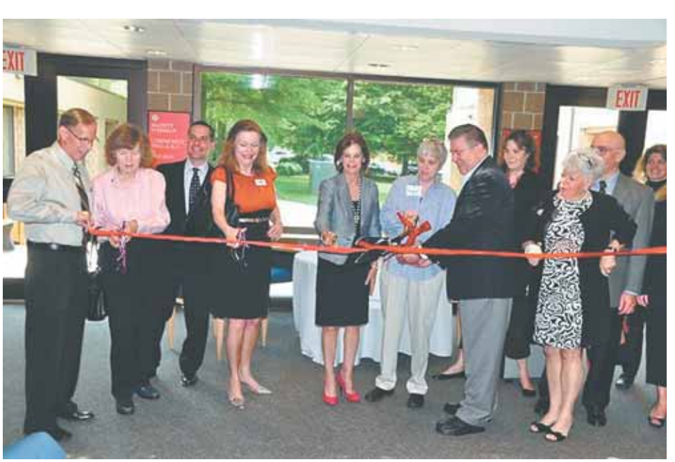
Connection File Photo

Local officials and volunteers cut the ribbon for the new McLean Senior Source help desk at McLean Community Center on May 15, 2013.