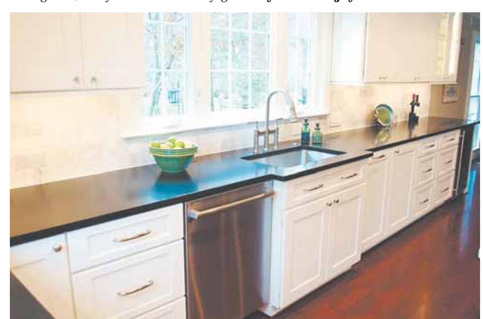
The kitchen's work triangles include a farm sink and custom designed cabinetry supporting spacious work surfaces.

older, we stopped using the living room. Which made our first floor plan rather odd — since the kitchen was too dark and cramped and didn't have the kinds of storage capacity that I really needed."