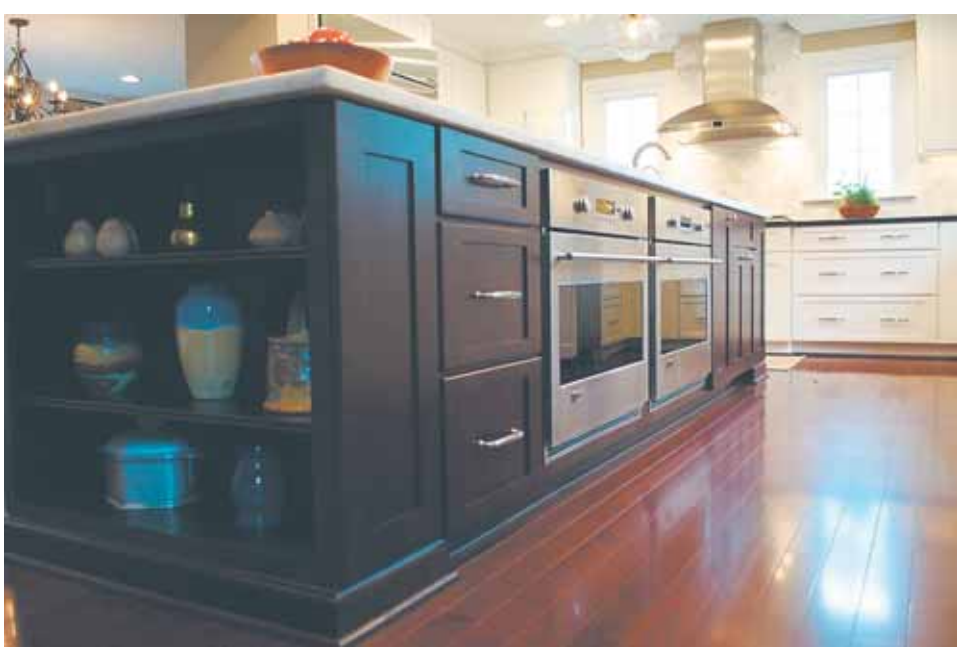
The new food prep island features two baking ovens positioned to help Joy Green enjoy one of her favorite culinary pursuits.