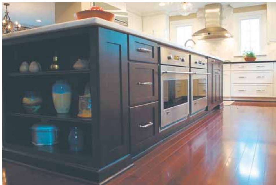
The new food prep island features two baking ovens positioned to help Joy Green enjoy one of her favorite culinary pursuits.