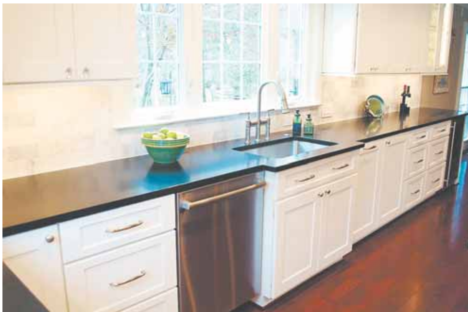
The kitchen's work triangles include a farm sink and custom designed cabinetry supporting spacious work surfaces.