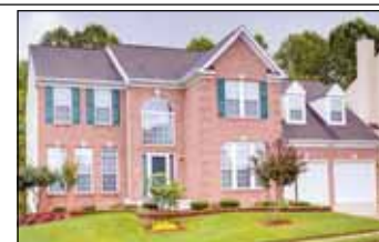
Dumfries $485,000 Welcome Home to your Gorgeous Light-filled Home Backing to Woods * Great Home to Entertain Family & Friends * Breathtaking Sun Room Overlooks Woods. Extensive Beautiful Mature Landscaping & Custom Deck *