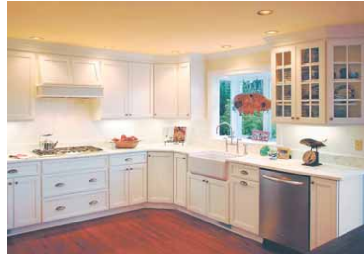
White cabinetry and white marble counter tops give this kitchen a clean, airy feel.

The kitchen includes dark cabinetry made from alder wood, which is contrasted against light granite countertops. "We eliminated the peninsula and the low-hanging cabinets above it and were able to open up the kitchen to the rest of the home," said Brick.