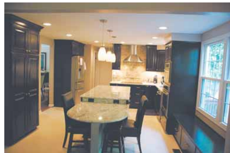
Dark cabinetry and contrasting light granite add warmth to this kitchen.

Instead of including a separate kitchen table, the Nicely design team modified the height of the end of the island for standard chair-height seating. "This family can now work, eat, and enjoy company without the restrictive barriers of their past kitchen," said Brick.