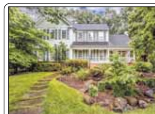
Centreville $619,999 The rest of your life. Enjoy it to the fullest in this wonderfully designed open & airy home. You'll love the hardwoods and cathedral ceilings on the main level, the charming eat-in kitchen, the delightful family room with 2-way fireplace, the wonderful front porch, & the superb master bedroom suite with luxury bath. Gorgeous lot! Act fast & buy it today.

Access the Realtors Multiple Listing Service: Go to www.searchvirginia.listingbook.com