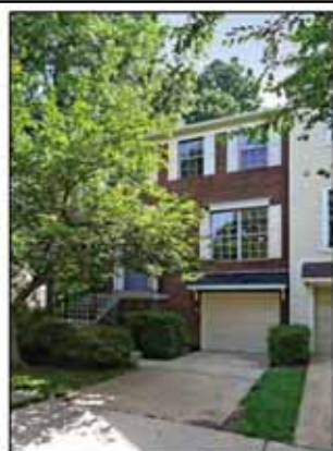
Burke Centre • $389,900 • End Unit TH w/ Garage