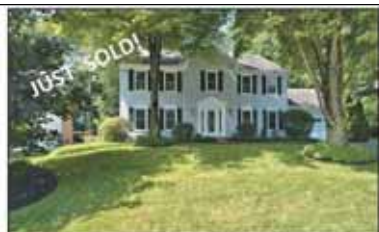
Fairfax Station Crosspointe $709,900 Updated kitchen & baths, new windows & HVAC, hardwood floors on 3 levels, 2 story foyer. Finished basement with kitchenette. Screened porch. Fenced back yard with mature trees! www.8532ChaseGlen.info