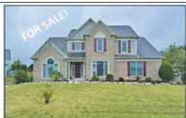
Fairfax Station Crosspointe $710,000 Sun-filled open floor plan with grand 2 story family room! Beautifully updated cherry kitchen with center island & breakfast room! Updated bathroom! Finished bsmt w/ dance floor! www.9614GaugeDrive.info