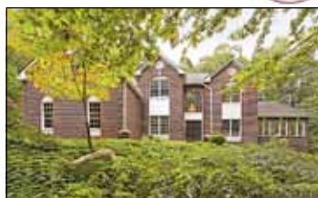
Clifton - $899,000 Located in beautiful Rose Hall community, this spacious home sited on 5 incredible acres boasts updates and attention to detail!

View more photos at www.hermendorfer.com