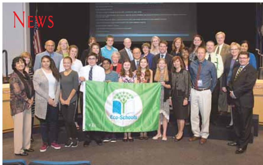
Students from Lanier Middle School in Fairfax spoke to the School Board about their environmental stewardship projects as part of a presentation surveying the Fairfax County Public Schools Get2Green program and School Environmental Action Showcase.