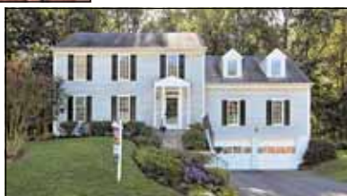
Burke Centre - $674,500 Beautifully updated, spacious colonial on quiet pipestem backing to woods in a terrific community!