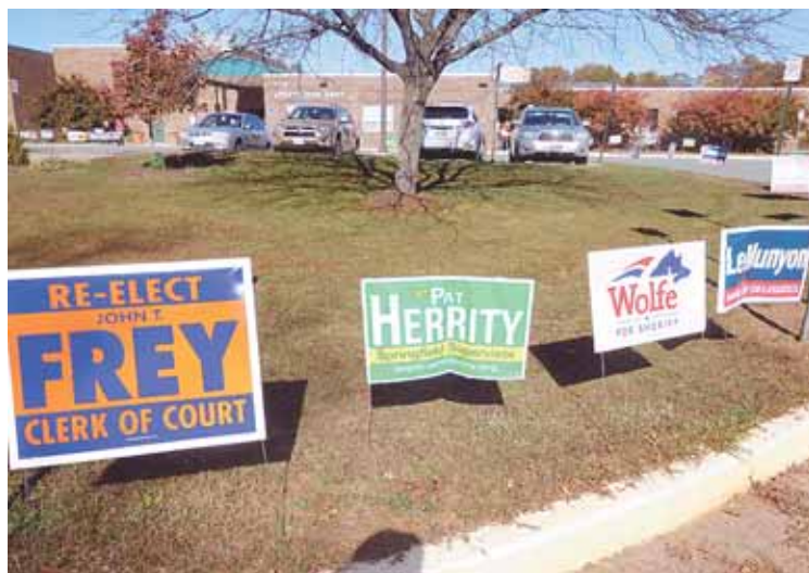
Some of the election signs for the Republican candidates.