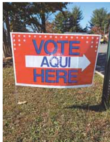
This sign in English and Spanish tells people where to vote.