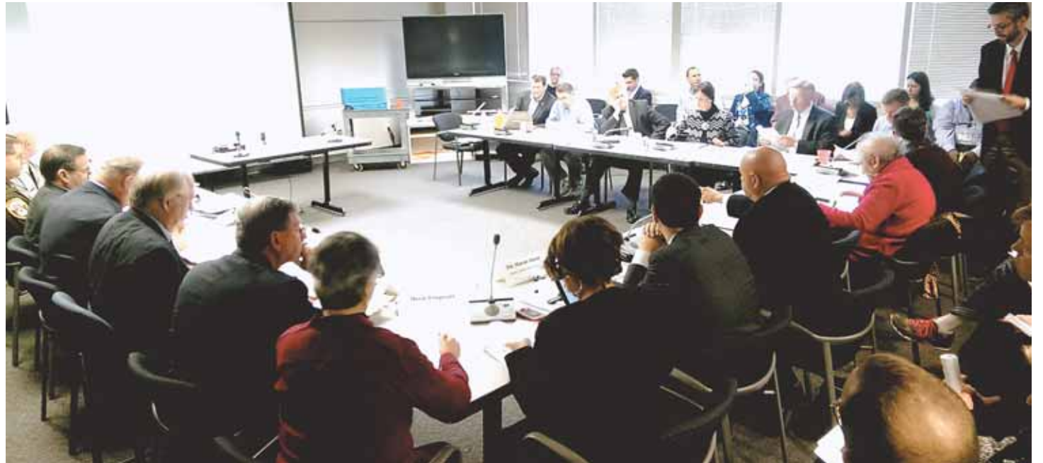
Members of the Board of Supervisors and representatives of the Ad Hoc Police Practices Review Commission met at the Oct. 27 public safety committee to begin reviewing the 142 final recommendations of the commission, including a civilian review board and independent auditor.