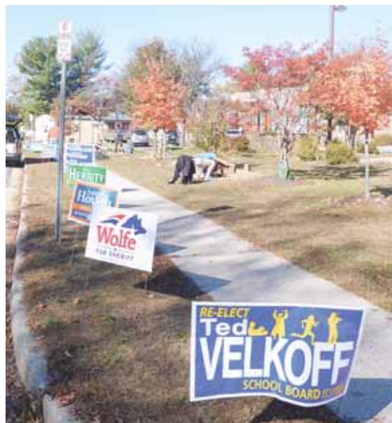
Election signs outside Greenbriar East Elementary.