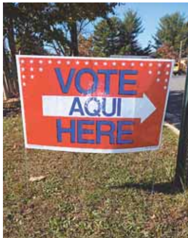
This sign in English and Spanish tells people where to vote.