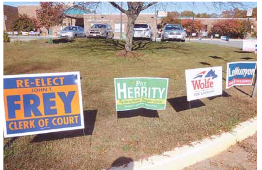
Some of the election signs for the Republican candidates.

ministration," he said. "And any opportunity I can get to further that progress and undo the quagmire that was bestowed upon the commonwealth by the previous, criminal administration, I will take it. I'll do so by voting, being an activist for the causes I care about and encouraging others to look beyond backwards ideology."